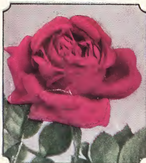
Etoile de France

★ Mme. Butterfly. H.T. This American sport of the favorite Ophelia has delicately modeled flowers of tender pink and gold, and is one of the sweetest and most pleasing Roses. Its lovely spiral buds slowly unfold into big flowers, though not very full, of charming shape and dreamy color, very highly scented, and lasting unusually long. The stems are fine and very strong, making it one of the best Roses