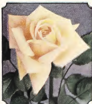
Mrs. Aaron Ward