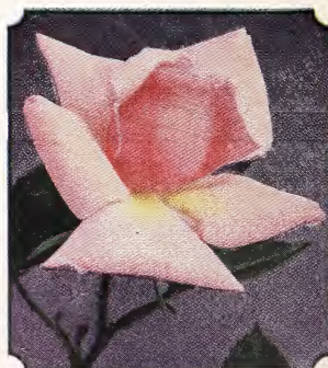
Mme. Edouard Herriot