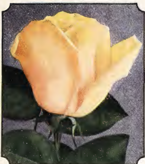
Duchess of Wellington