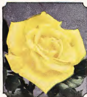
Souv. de Claudius Pernet

This 1927 Star Dozen does not include one variety offered in the original dozen twenty years ago, because our policy has been that the Star Dozen must contain the most up-to-date, tried and proven, best Roses. Each year one or two varieties are dropped out to make room for other superior kinds that have stood our rigid test for this dozen and have scored higher points than the ones that are dropped. We cannot make a dozen more than twelve, so we have raised the standard of the twelve.