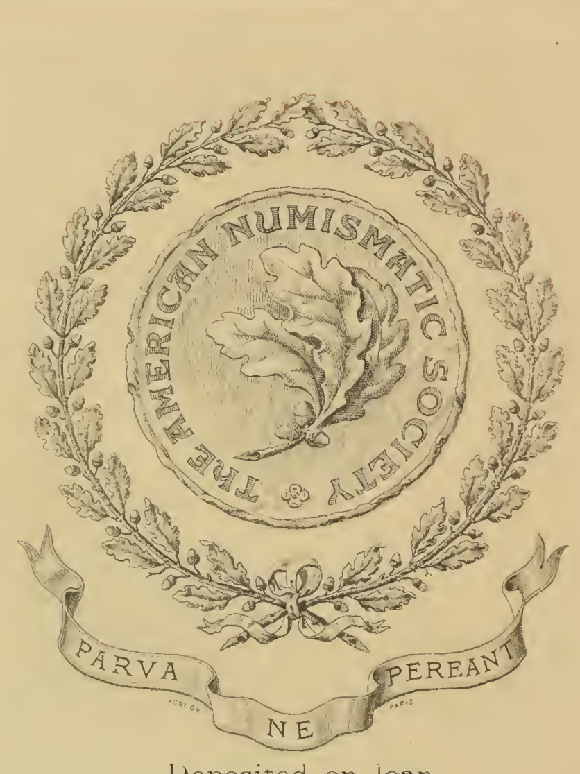
Deposited on loan by order of the Trustees of THE HISPANIC SOCIETY OF AMERICA