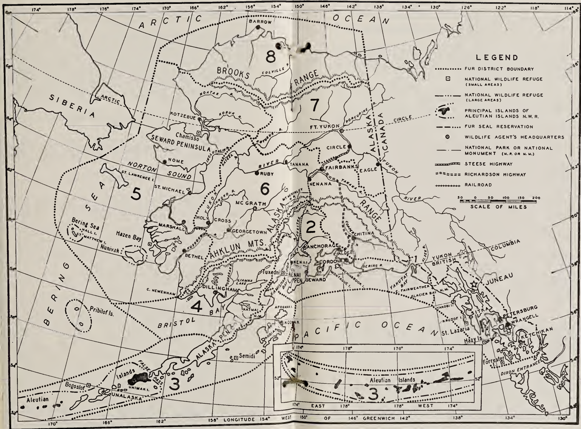
FIGURE 1.—Map of Alaska showing boundaries of fur districts, wildlife refuges, and headquarters of wildlife agents of the Alaska Game Commission.