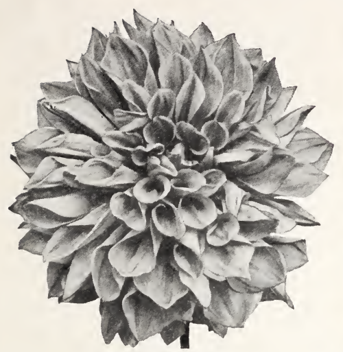
BASHFUL GIANT (One-fourth Actual Size)

BONNIE BLUE—Sometimes classed as a Hybrid Show. A very popular Dahlia. It is near blue in color and blends nicely with almost any other color. The form is perfect. Keeping quality when cut is good, in fact, it is an all purpose Dahlia of medium size, giving it a very great variety of uses. We have accumulated sufficient stock of this variety to make it a leader. 35c each, 3 for 90c. $3.00 per dozen. BONNIE BRAE—A real beauty; color, cream