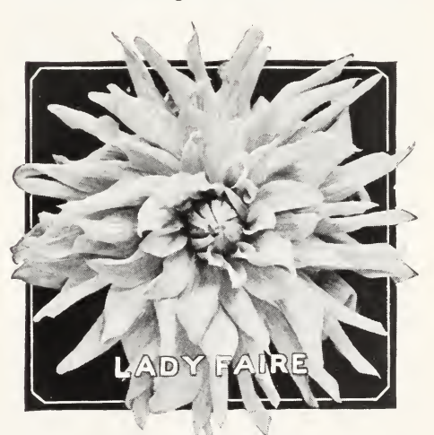
(One-third Actual Size)

JERSEY'S RADIANT (Waite)—Large flowers of bitter sweet orange, long, stiff stems. Very attractive and a great favorite. $1.50 each.