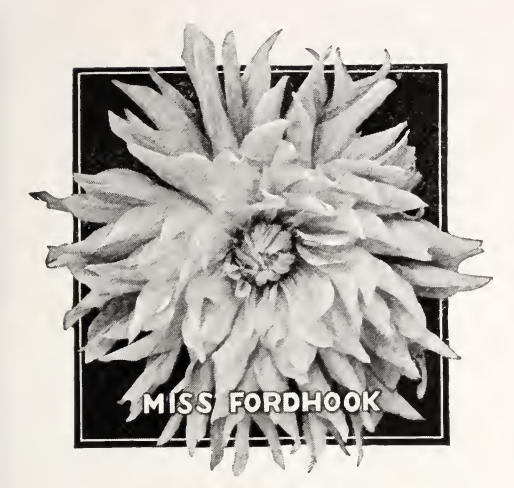
(One-third Actual Size)

tive, as a hybrid cactus, and it could be classified as either from its conduct in our garden. A flower very much admired. 50e each, 3 for $1.35.