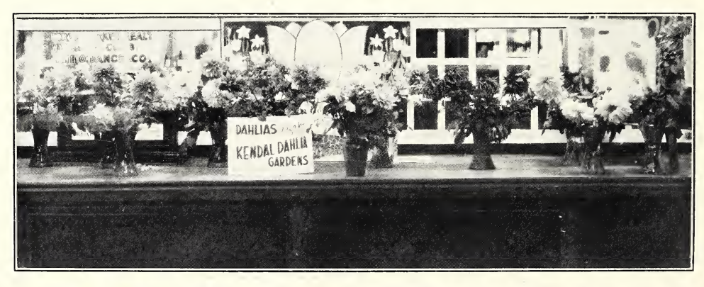
A window display of some Dahlias originated from seed in Kendal Dahlia Gardens, none of which have yet been introduced. Are they not pretty?

FOR $3.50, we will ship postpaid, at planting time, one each ELITE GLORY, ADALINE WINTER, PRIDE OF WINTER-HAVEN, QUEEN OF NORTH MENTOR, PRINCESS JULIANA, BONNIE BLUE, PAINESVILLE and IDA MAY CARLETON, eight very beautiful dahlias that will grace any garden, each one labelled, and guaranteed to grow.