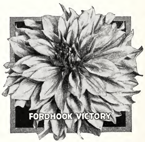
(One-third Actual Size)

FORDHOOK RADIANCE—Bright peach-red blooms suffused with metallic bronze and just a suspicion of salmon on the outer petals. $1.00 each. 3 for $2.70.