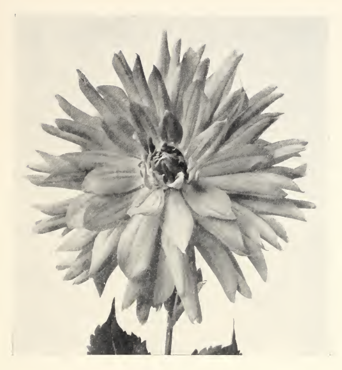
A. LINCOLN, s. c. (See Page 19.)