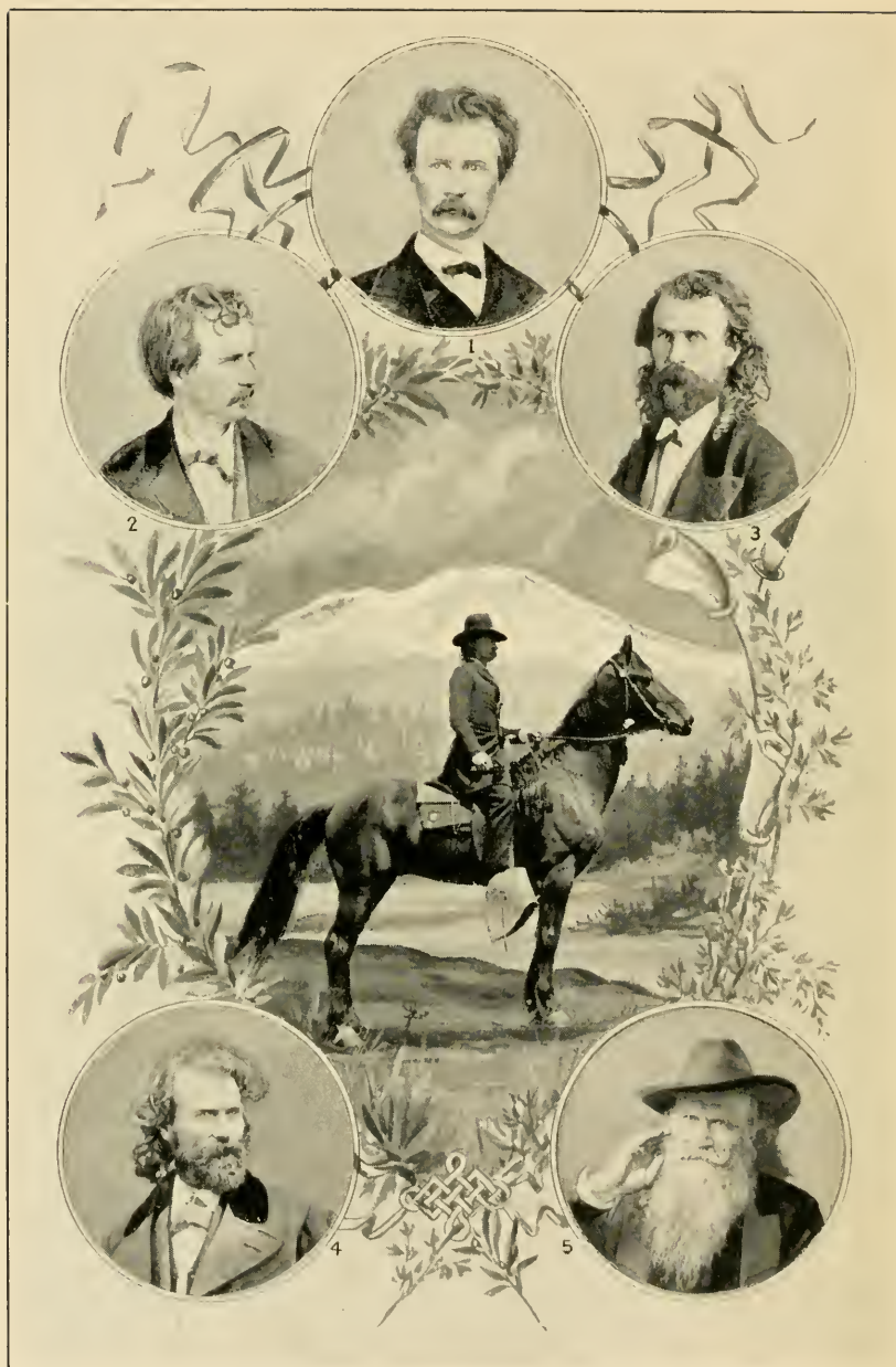
1—Oregon, 1865. 2—London, 1870.