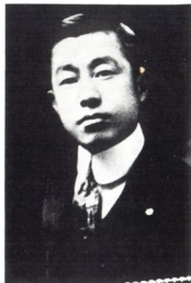
AMBASSADOR HANIHARA His Sense of Humor and his Tact are Equally Renowned and Essential

The Foundation Company announced the completion of a contract to build four miles of subway in Tokio.