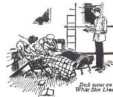
Deck scene on White Star Liner

Our complete ocean services offer five sailings weekly to English ports, three to France, and one each to Ireland, Belgium and Germany.