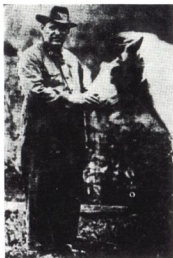
SMITH W. BROOKHART Iowa's new Senator says: "I have never owned evening clothes and never propose to"