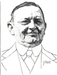
SENATOR OSCAR W. UNDERWOOD He says he may contend for the Democratic nomination in 1924. He has sailed for Egypt.

An amendment to inaugurate the President and seat Congress in January instead of March, following election.