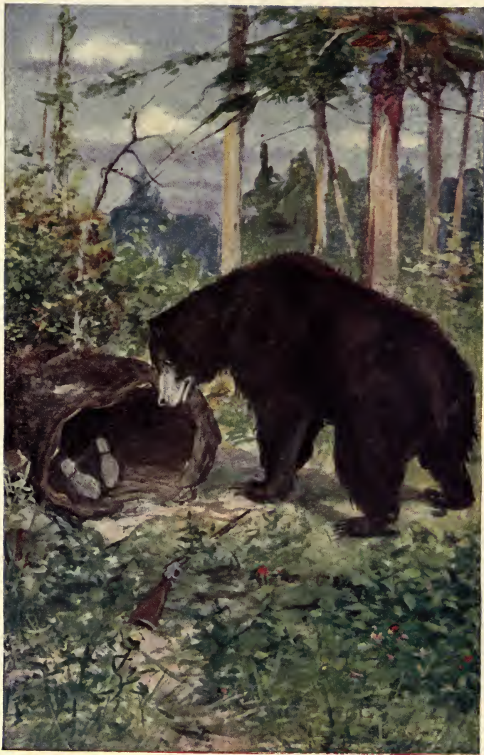
The bear was waiting there.—Page 111.