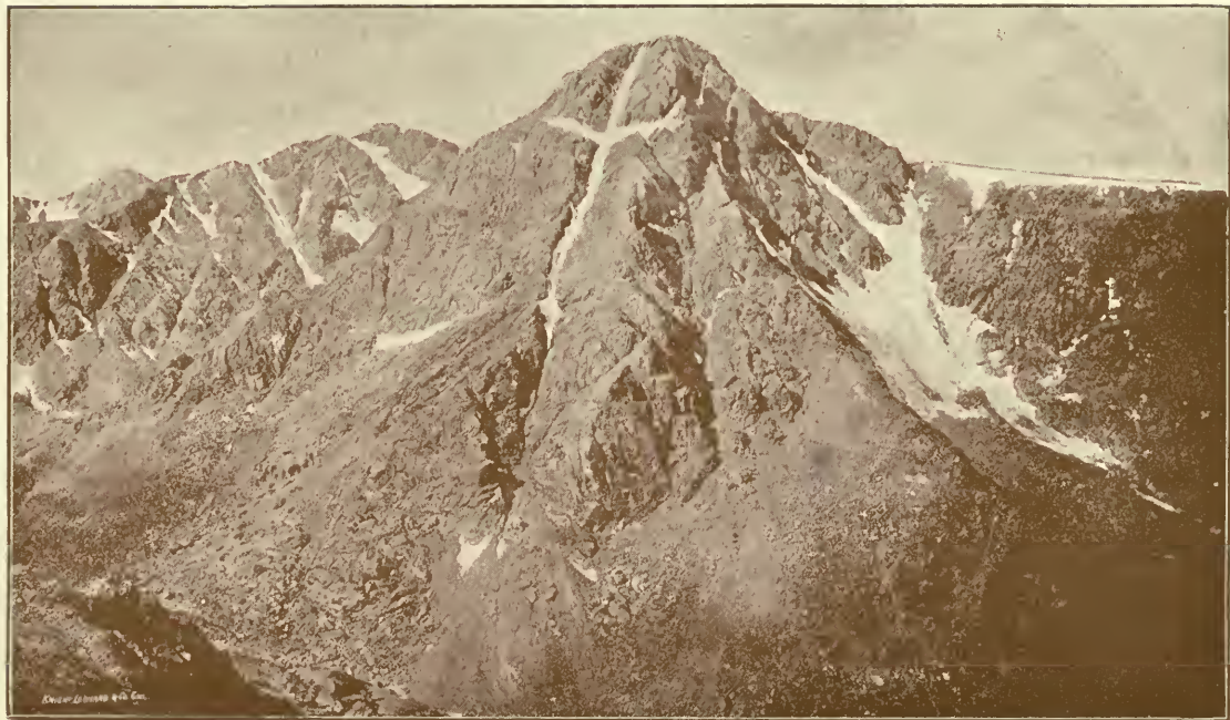
MOUNT OF THE HOLY CROSS.