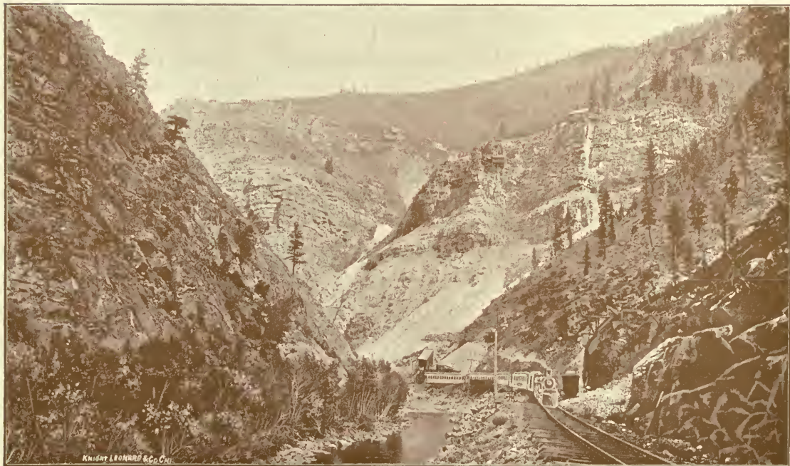
EAGLE RIVER CAÑON.