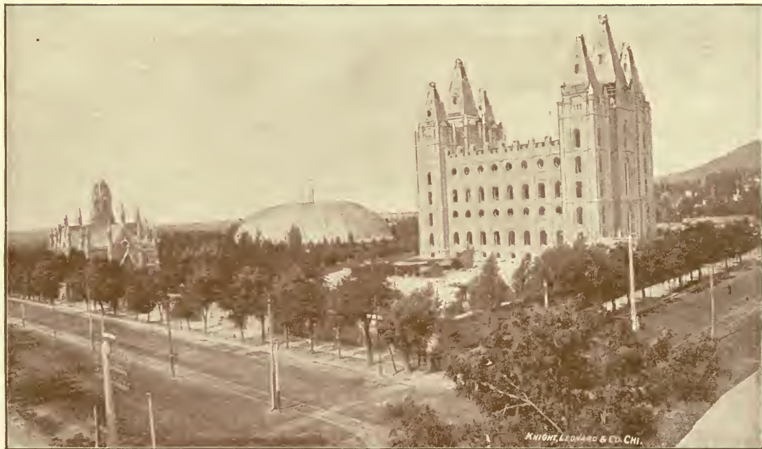
THE TEMPLE AND TABERNACLE.