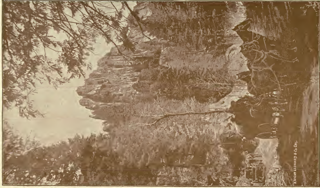
MASONIC TEMPLE. (Ute Pass.)