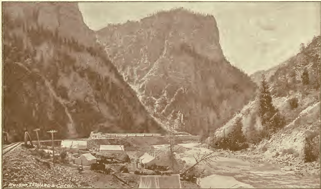
KING SOLOMON'S TEMPLE.