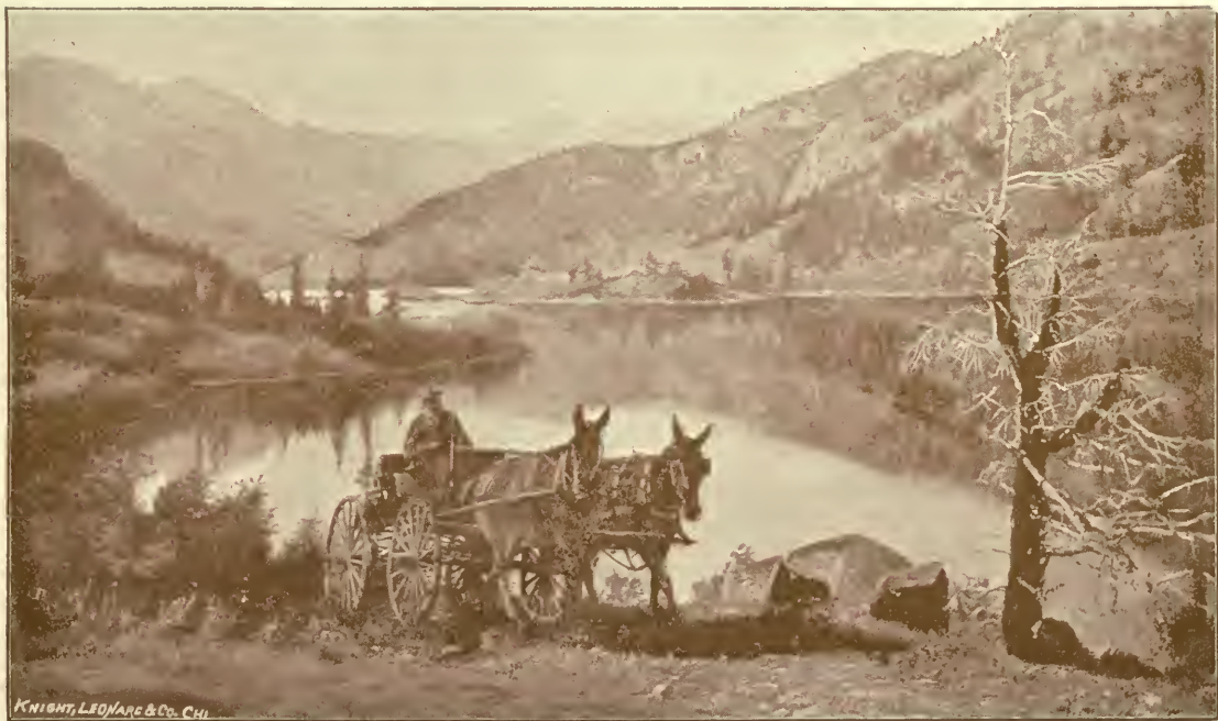
LAKE SAN CRISTOVAL.