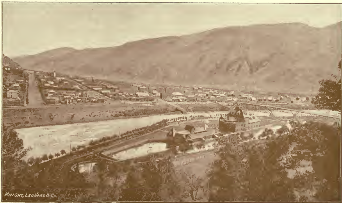
BATH HOUSE AND POOL, GLENWOOD SPRINGS.