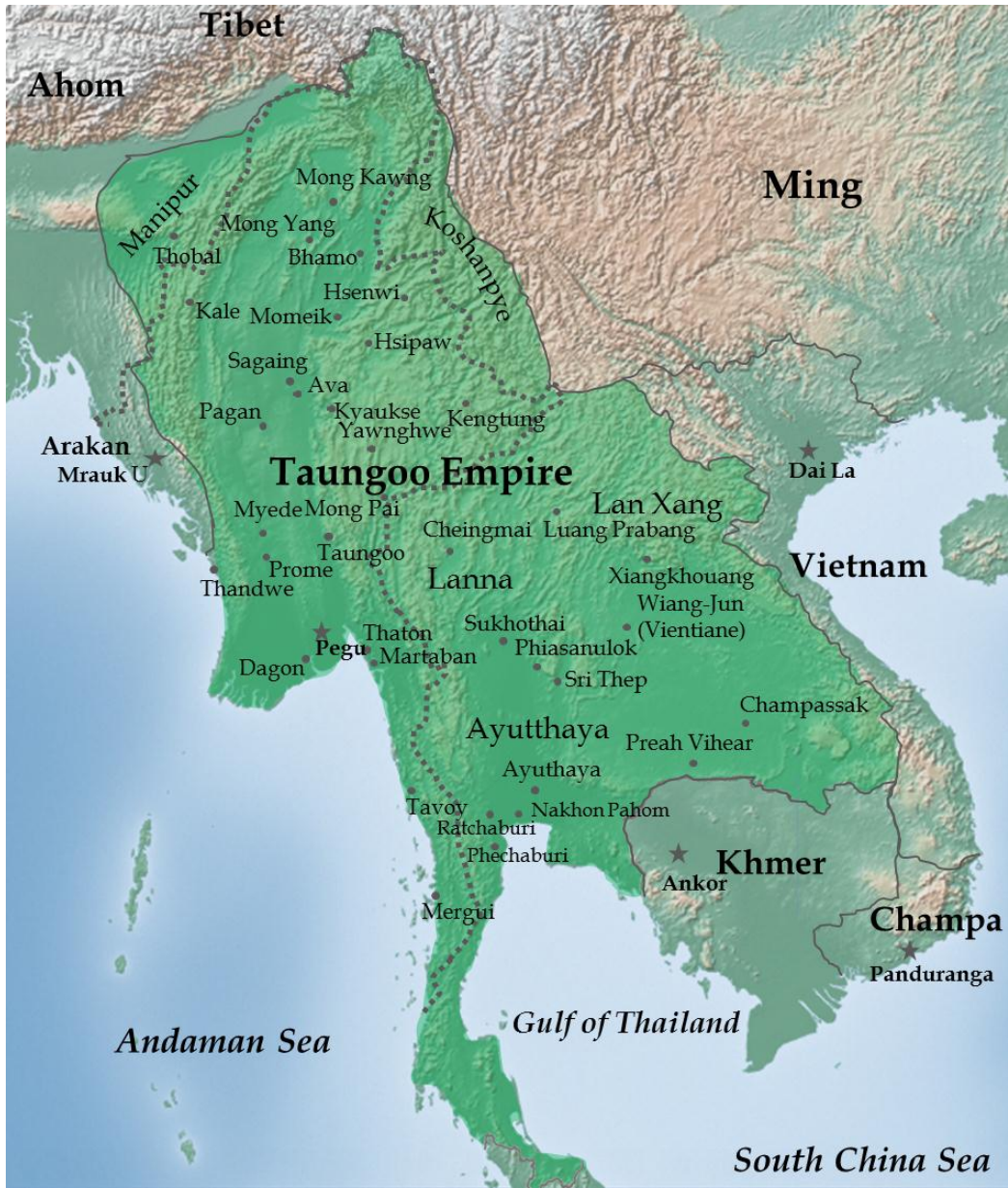
Figure 3. The Extents of the Toungoo Empire in 1580 (From Wikipedia, “Burma”)

The Pagan, Konbaung, and Toungoo dynasties similarly organized their kingdoms into territorial categories that defined each area’s relationship to the state. There were slight variances between the dynasties, but each dynasty similarly had a power and influence that was administratively invasive locally, but decreased in influence with increased distance from the capitol. The basis for power was built upon the local Burman population, and from that base expanded outward to different degrees upon the