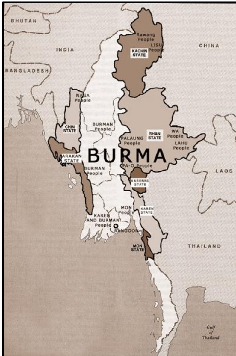
Figure 2. Burma's Ethnic States and Ethnic Population Concentrations 11

The atrocities and horrors of Burma's ethnic conflict are the very kind that has compelled scholars and politicians to conceptualize and implement government processes