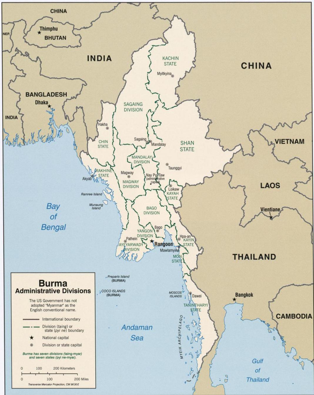
Figure 4. Burma's Administrative Divisions 217