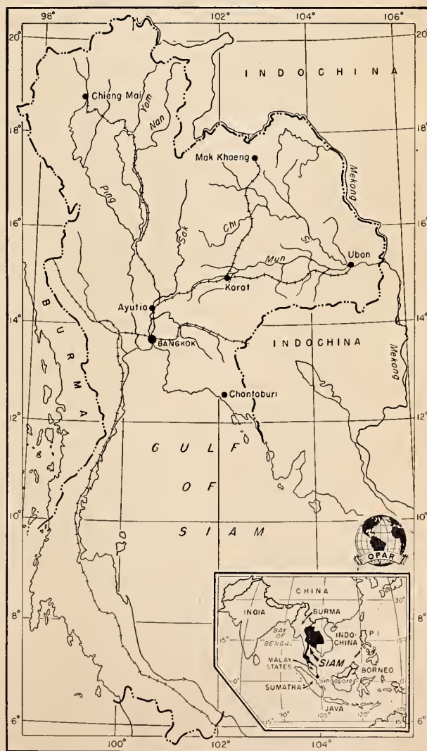
FIGURE 1.—Reference map of Siam.

The soils of Siam are diverse. Except for very fine sandy and silty soils close along the banks of the larger rivers, the Bangkok Plain has heavy