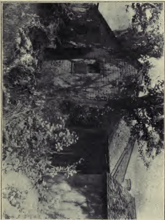
THE OLD HOMESTEAD