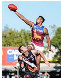
Australian rules football