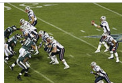
American football , also known as gridiron football