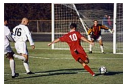
Association football , also known as soccer