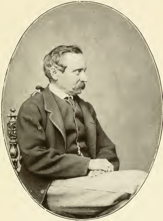
PRINCE HOHENLOHE AT THE TIME OF THE BAVARIAN MINISTRY