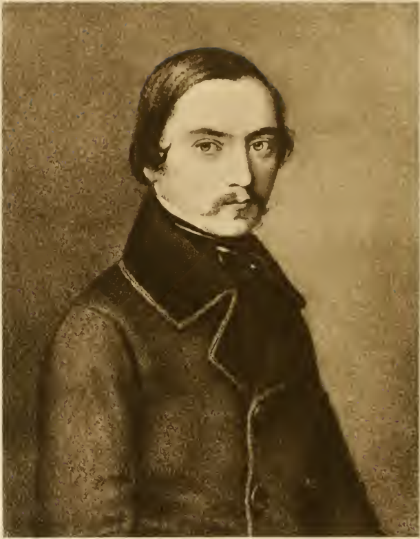
Prince Chlodwig of Hohenlohe-Schillingfürst in the year 1846