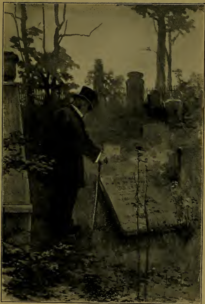
“ Whose name is written on the scroll of fame.”—Page 68. Longfellow's Poems.