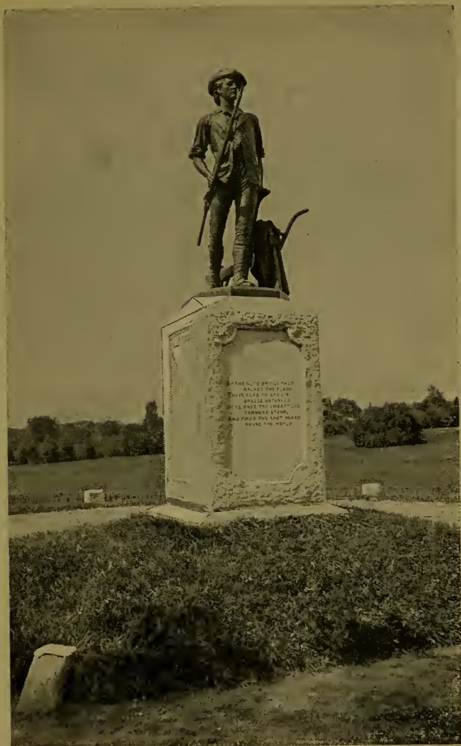
“Then sleep we side by side.”—Page 195. Longfellow's Poems.