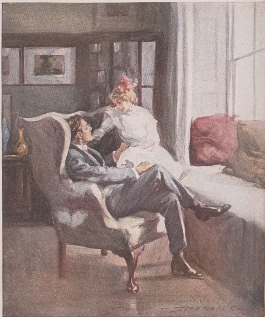
THE STORY OF THE WONDERFUL WHITE FLOWER (page 101)