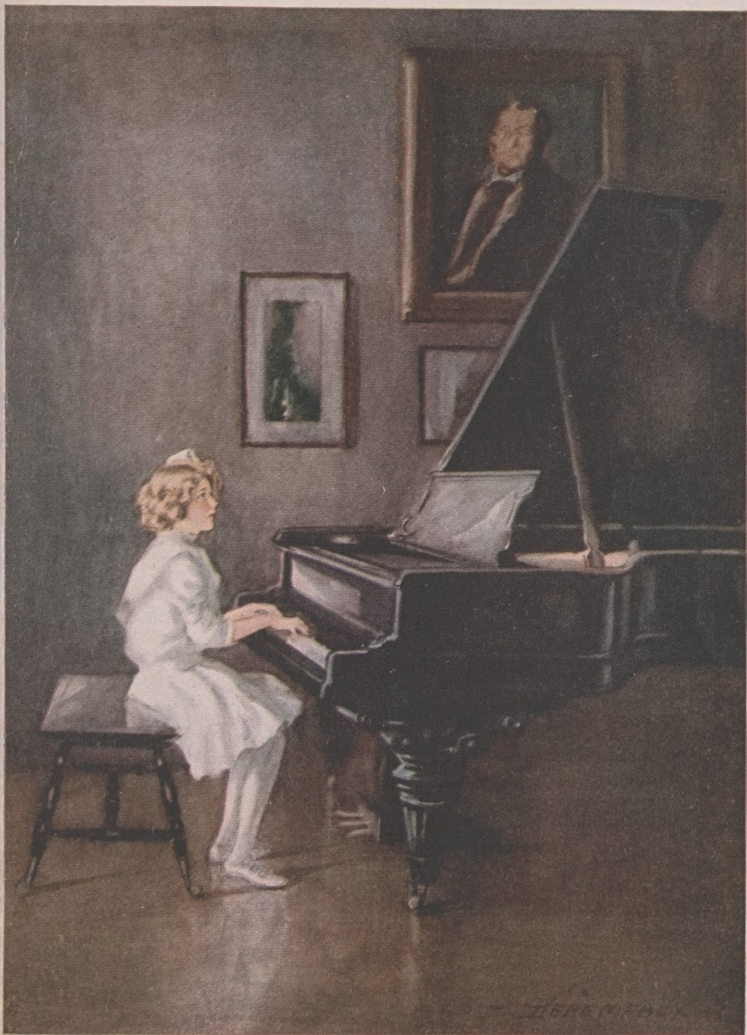
FORGETTING ALL BUT THE MUSIC SHE LOVED