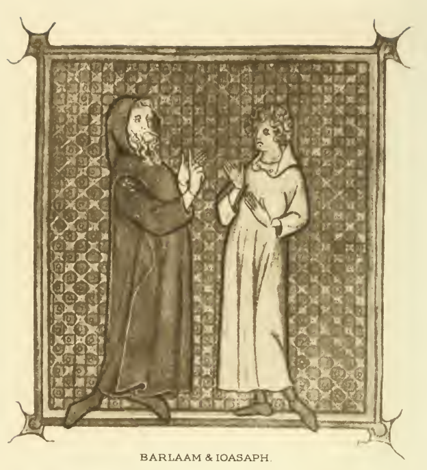
FROM FRENCH MANUSCRIPT OF THE XIV!!!! CENTURY, EGERTON, M S. 745.