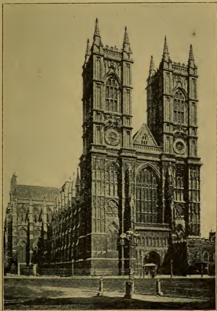
Westminster Abbey.—Page 240. Sketch Book.