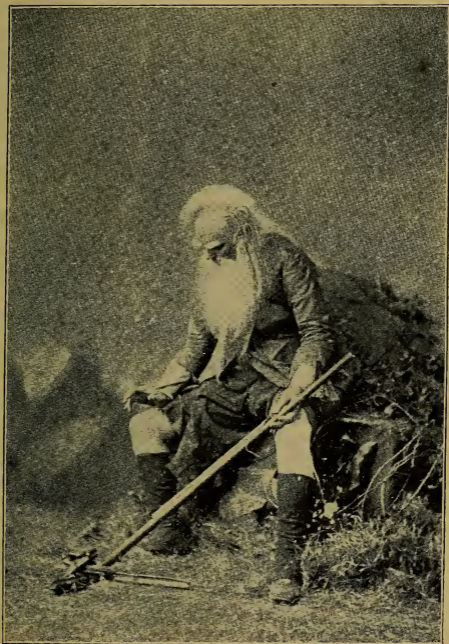
Joseph Jefferson as Rip Van Winkle.—Page 52, Sketch Book.