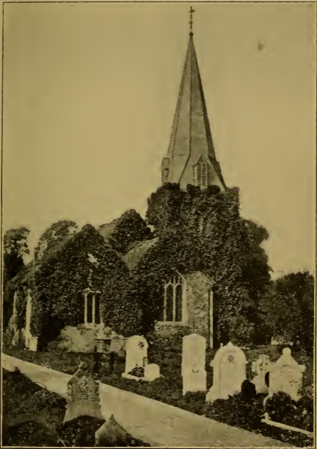
Stoke Pogis Church.—Page 142. Sketch Book,