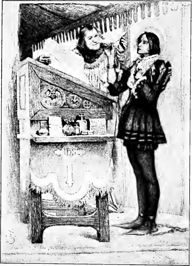
JOAN SIGNS THE LIST OF ACCUSATIONS