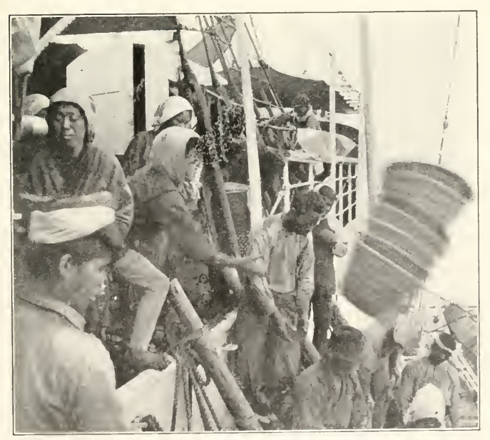
No 16 COALING SHIP, NAGASAKI