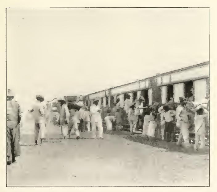
NO 10 ON CARS TO DAGUPAN