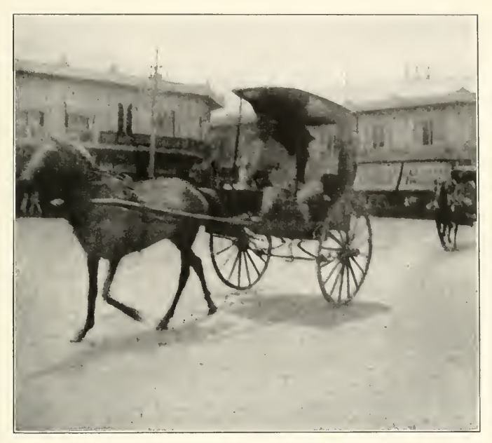
NO 7 STREET SCENE, MANILA