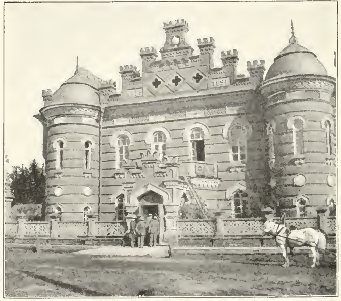
No 41 MUSEUM, IRKUTSK