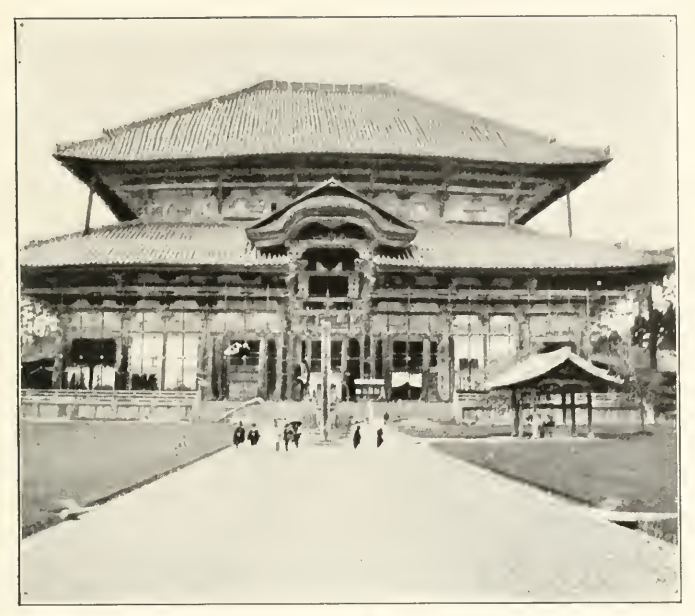
No 21 SHINTO TEMPLE AT TOKIO