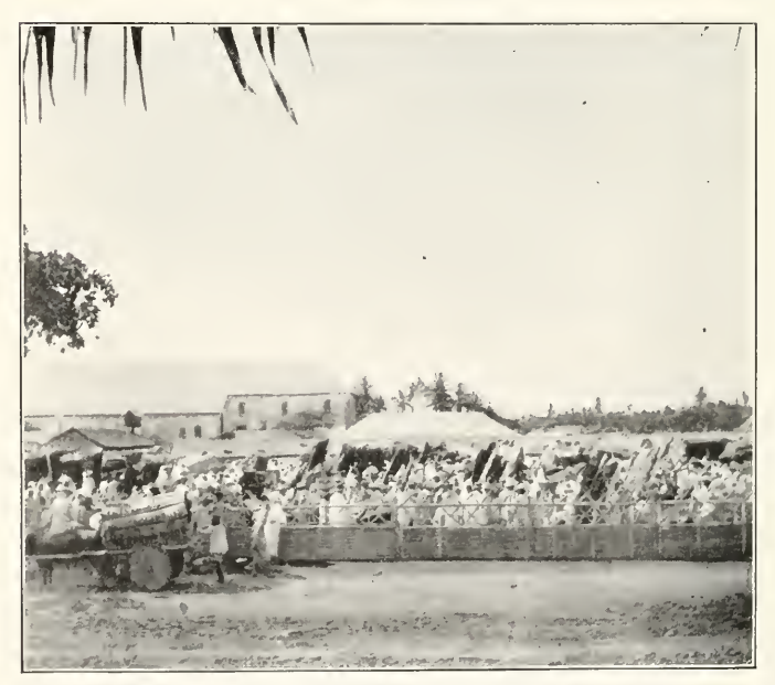
No 12 DAGUPAN MARKET