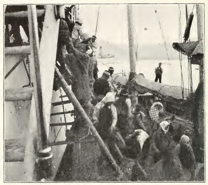
No 17 COALING SHIP, NAGASAKI