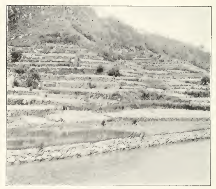
No 18 JAPANESE HILLSIDE