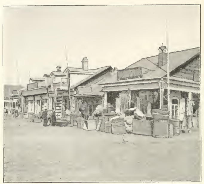
No 40 A BUSINESS CORNER IN STRETENSK