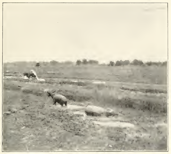
No 15 CARABAOS BATHING