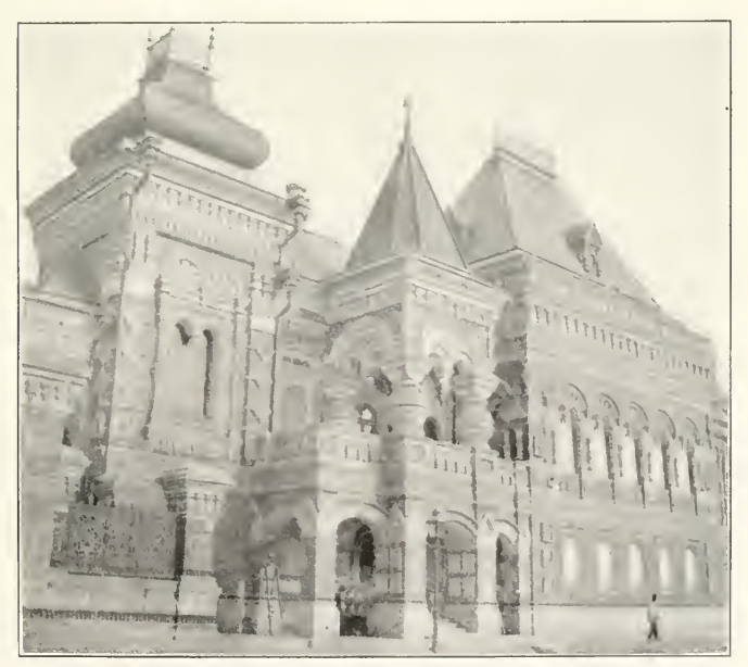
No 47 A BREWER'S RESIDENCE, MOSCOW