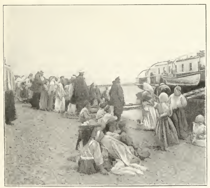
No 37 MILK AND BREAD SELLERS ON AMUR RIVER