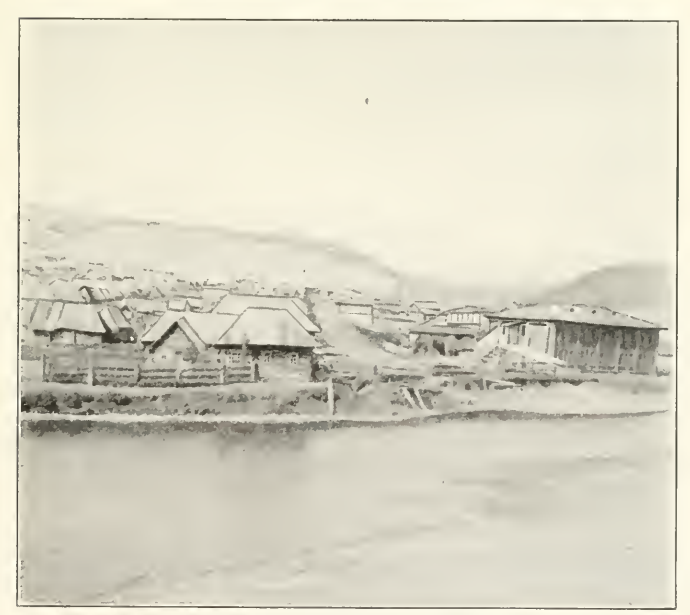
No 43 A SIBERIAN VILLAGE