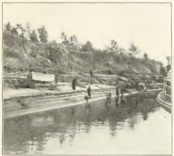
No 36 WAITING FOR WATER TO RISE ON THE AMUR