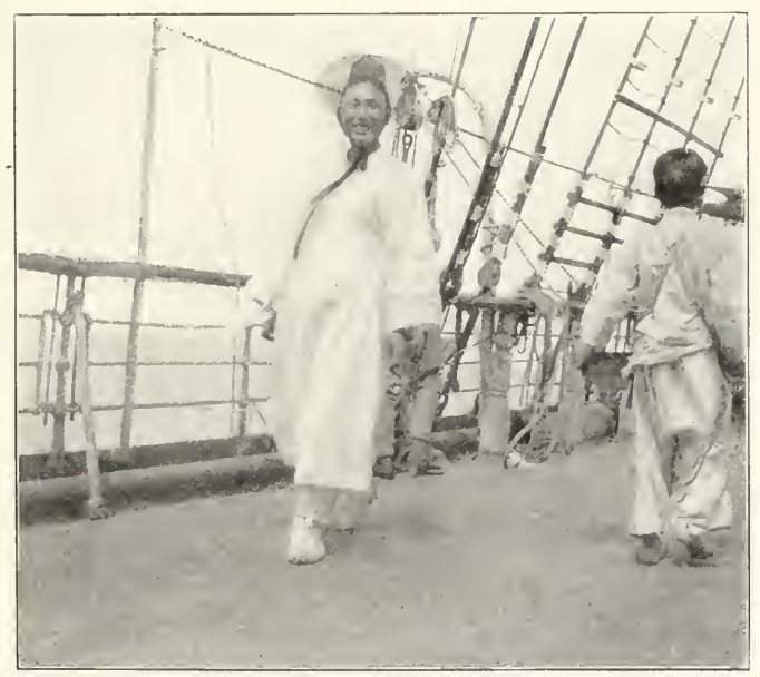
No 35 COREANS ON SHIP