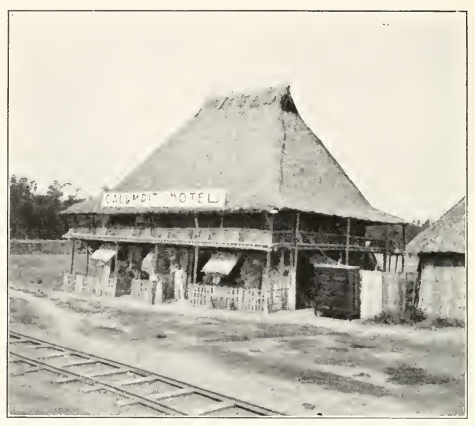
NO 11 CALUMPIT ON DAGUPAN R. R.