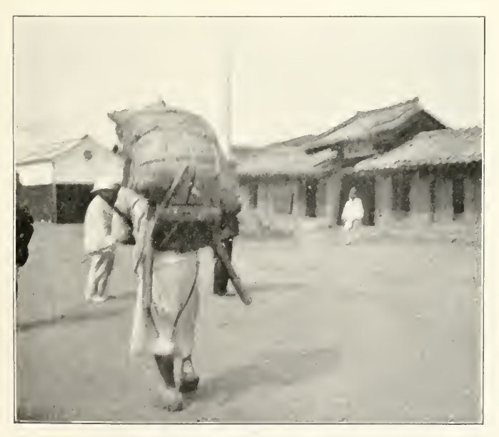
No 33 COREAN EXPRESS, GEUSAN, COREA