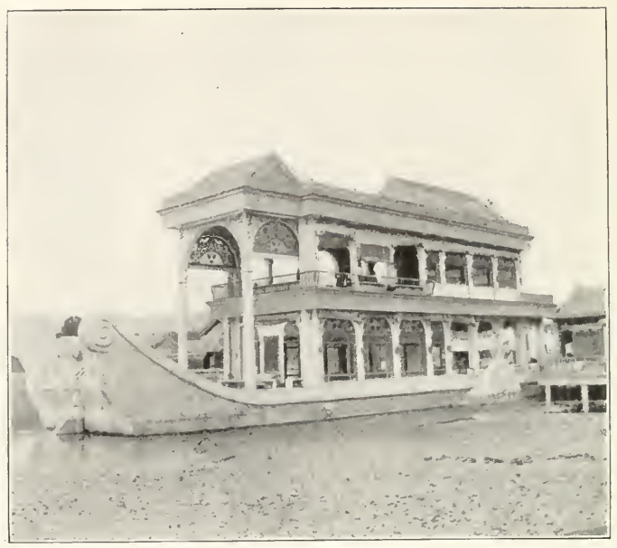
No 24 MARBLE BOAT SUMMER PALACE