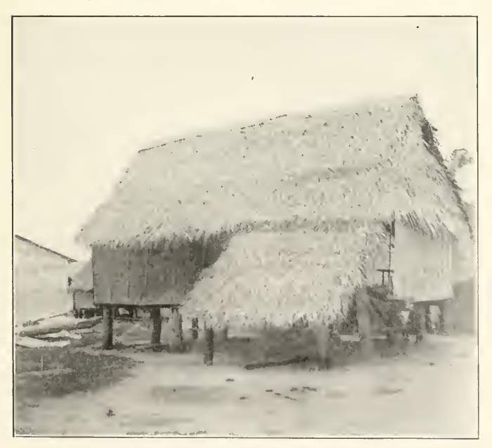
No 4 A HOUSE IN GUAM