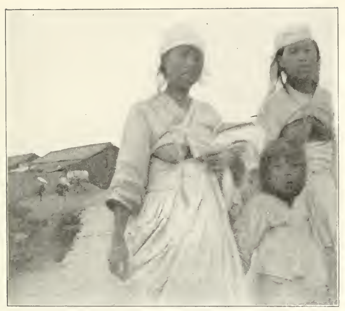
No 34 COREAN WOMEN, GEUSAN, COREA