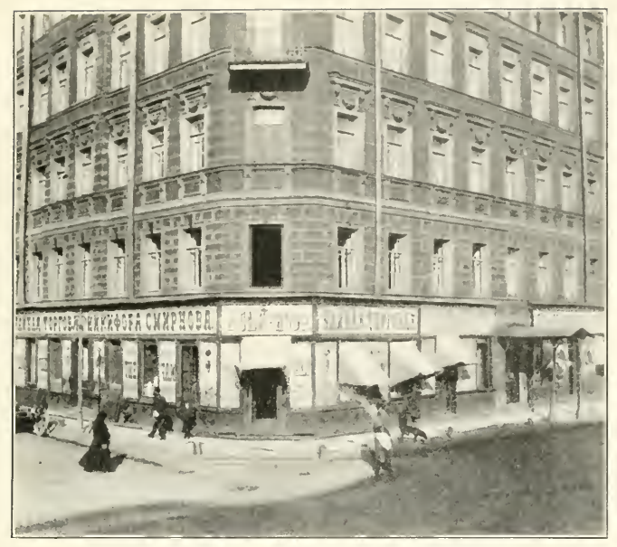
No 48 BUSINESS CORNER, ST. PETERSBURG