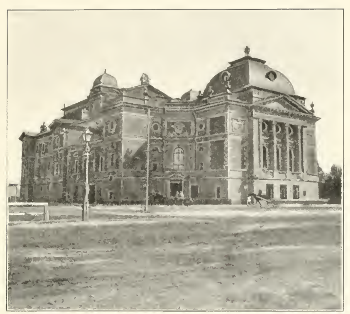
No 42 OPERA HOUSE, IRKUTSK