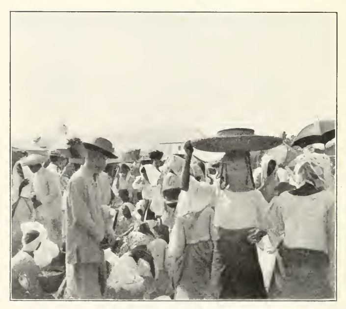
No 14 DAGUPAN MARKET