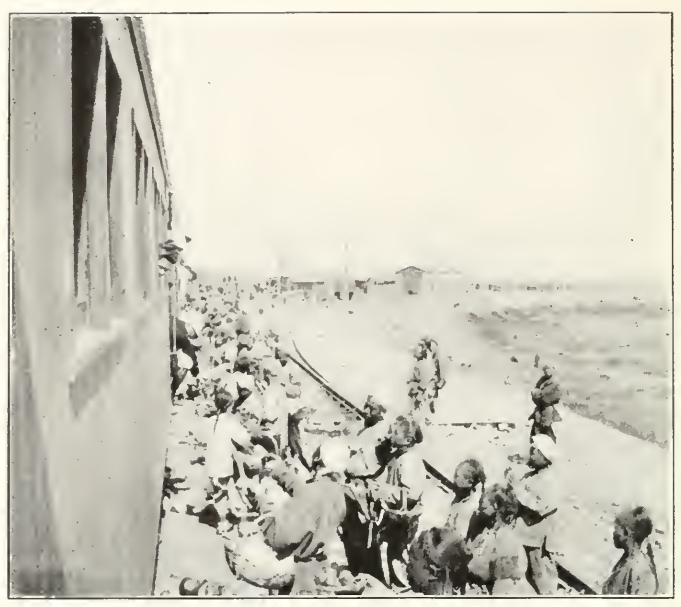
No 19 ON PEKIN R. R. CHINESE BOYS SELLING FRUIT