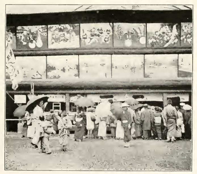
No 32 OSAXA DISTRICT, TOKIO Theatre in temple grounds