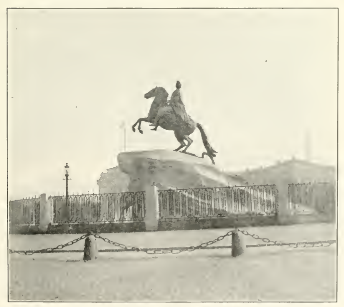
No 49 PETER THE GREAT MONUMENT, ST. PETERSBURG