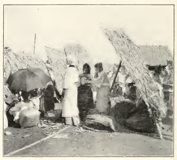
No 13 DAGUPAN MARKET