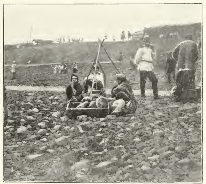
No 39 POVROSK, AMUR, AND SHILKU RIVER JUNCTION