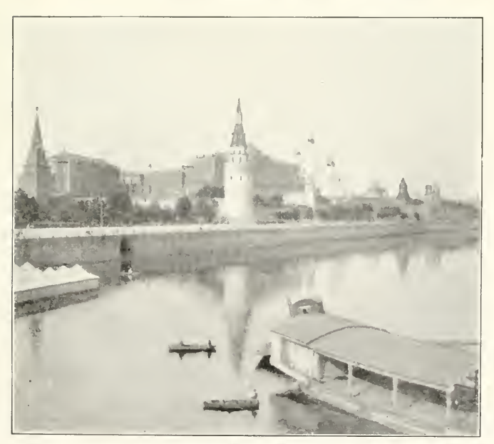
No 45 KREMLIN, MOSCOW