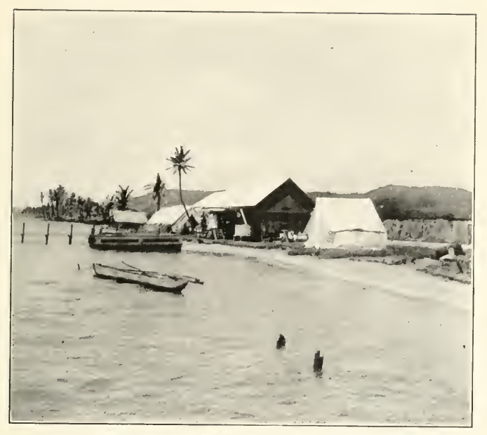
No 3 AMERICAN SUMMER HEADQUARTERS, GUAM