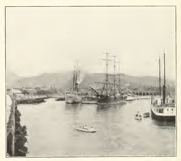
No 2 HONOLULU HARBOR