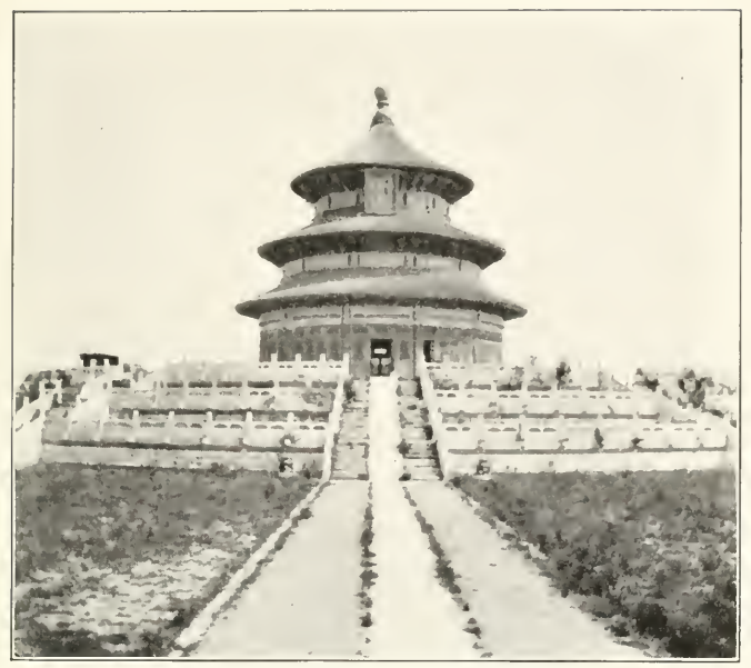
NO 22 TEMPLE OF HEAVEN, PEKIN