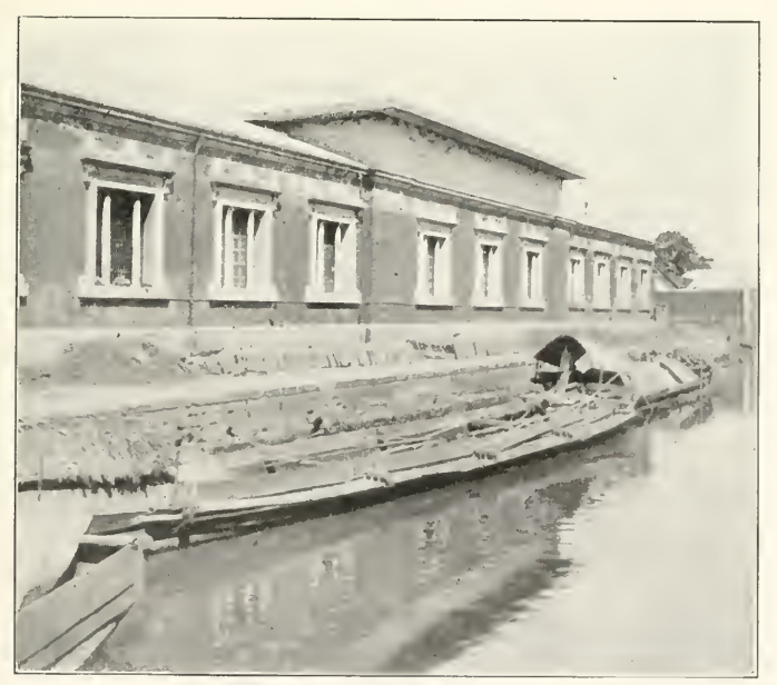
No 6 PASIG RIVER, MANILA