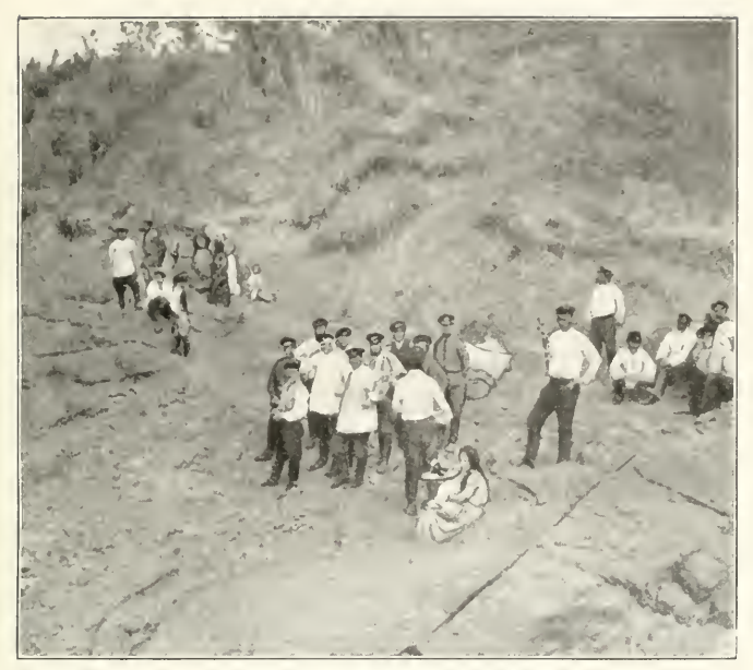
No 38 WOOD YARD, AMUR RIVER