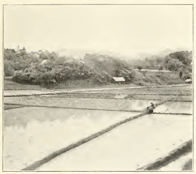
No 28 RICE FIELDS, JAPAN