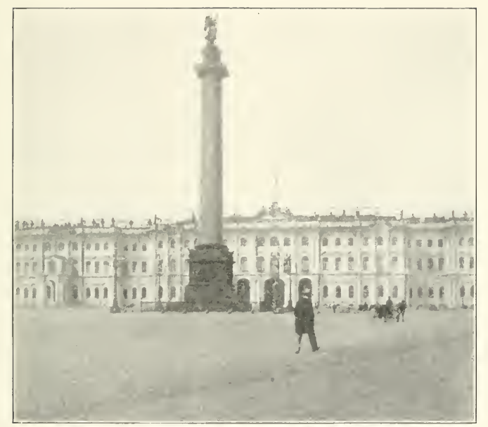
No 50 EMPEROR'S PALACE, ST. PETERSBURG