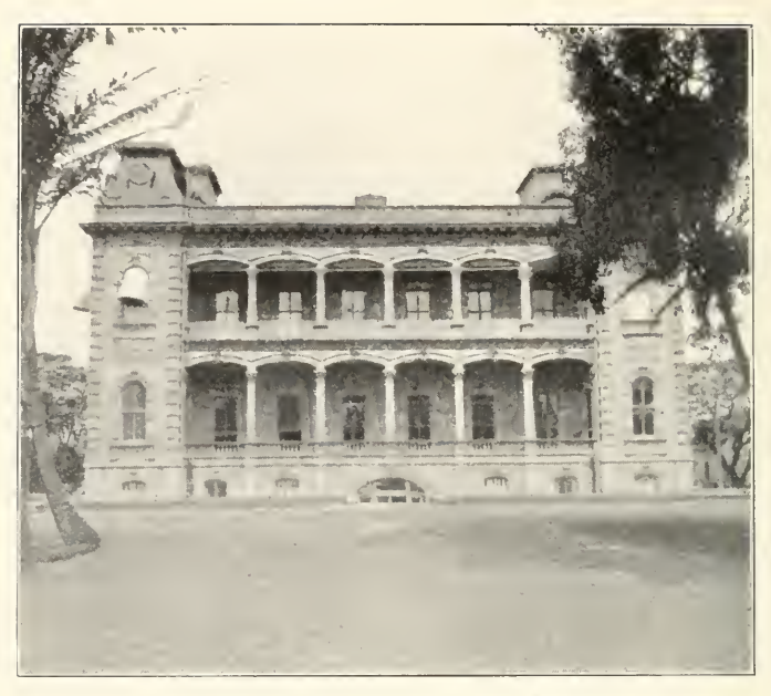
No 1 PARLIAMENT BUILDING, HONOLULU