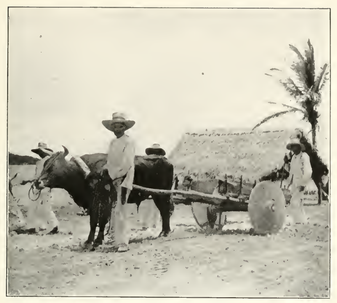
No 5 THE GUAM EXPRESS