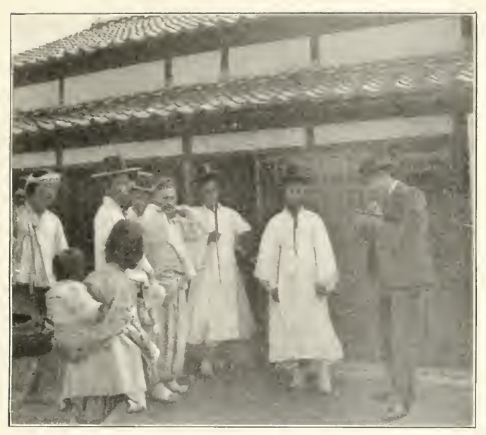
No 321/2 COREAN GROUP ON JAPANESE CONCESSION, GEUSAN