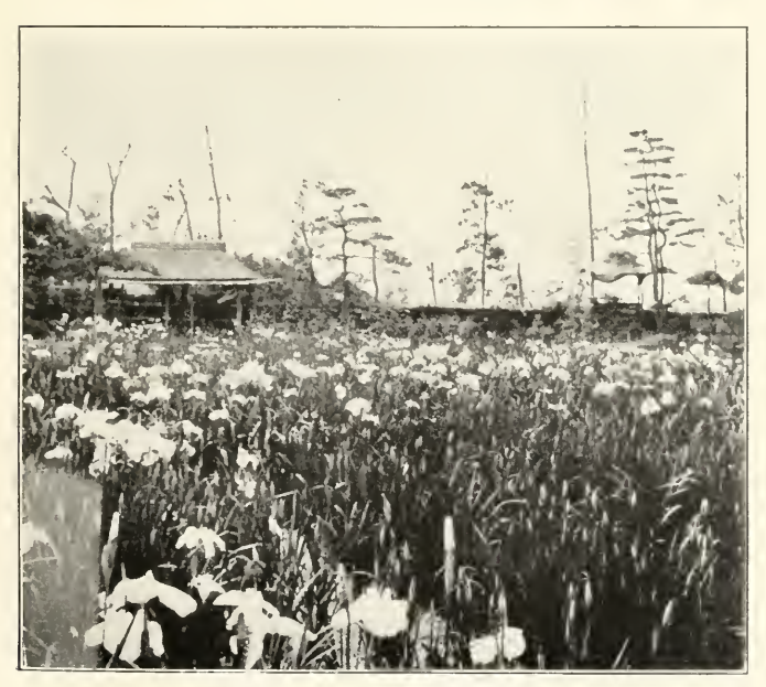
No 29 IRIS GARDEN, TOKIO