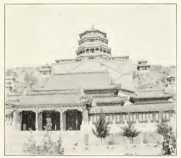
No 23 SUMMER PALACE