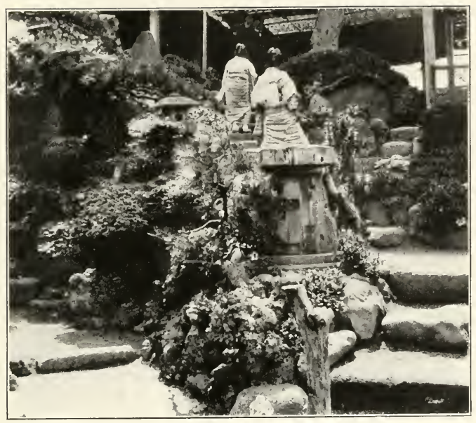
No 30 SEA HOUSE IN IRIS GARDEN, TOKIO