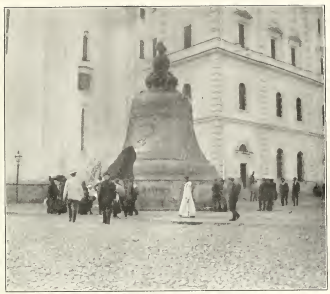
No 46 BIG BELL IN KREMLIN, MOSCOW.