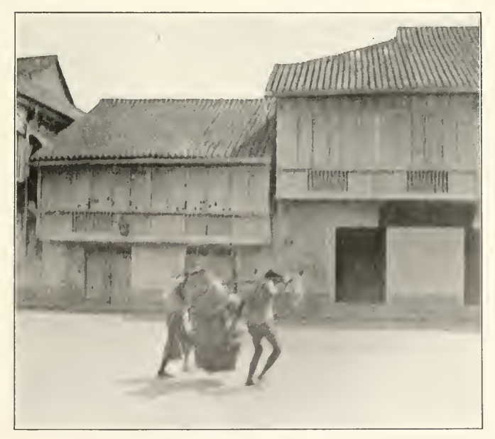
No 8 STREET SCENE, MANILA