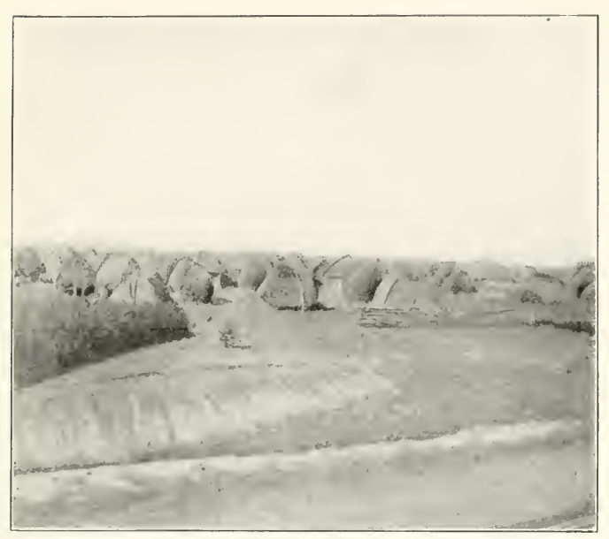
No 44 EUROPEAN RUSSIAN PEASANT VILLAGE