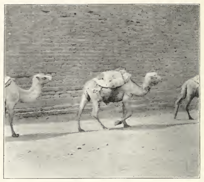
No 26 CHINESE R. R. AND CITY WALL