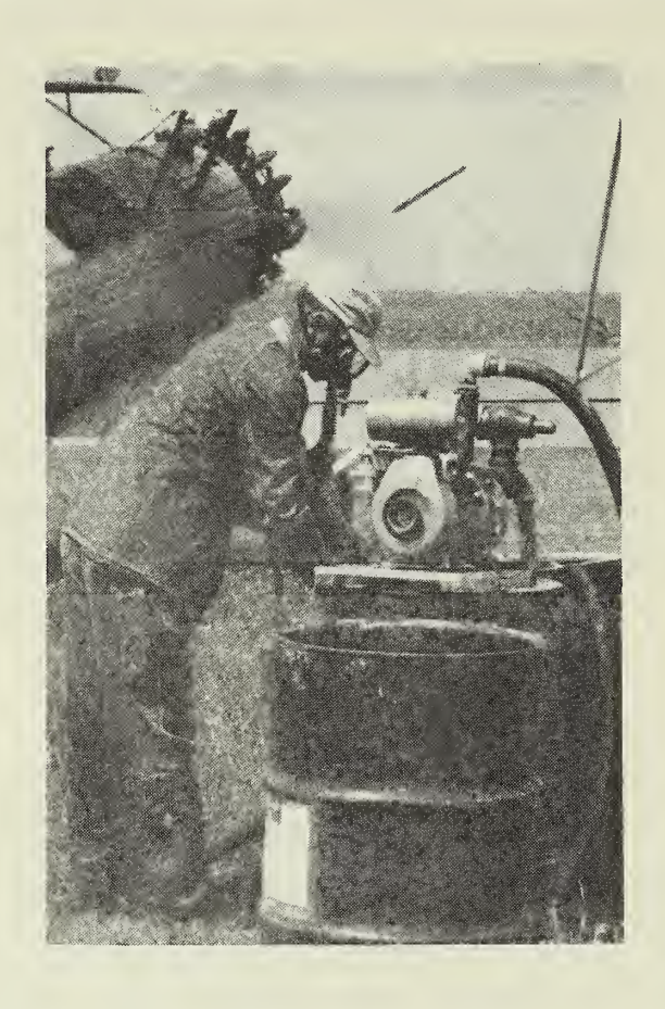
Protective clothing helps avoid over-exposure to pesticides.