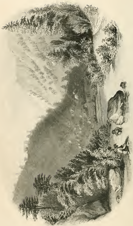
VIEW OF THE MOUNTAIN OF ST. PETER'S