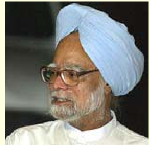
Congress PM Manmohan Singh