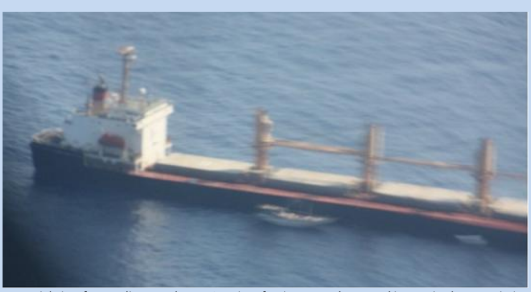
An aerial view from Indian Naval TU 142M aircraft. Pirates Mother vessel is seen in close proximity

Indian Navy's persistent efforts led to pirates evacuating a Chinese merchant vessel MV Full City.