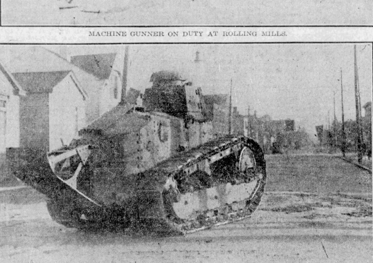
TANK ON BRIGHTON-ST. NEWPORT, IN HEART OF STRIKE ZONE

Thursday night, as a result of priviledge advice to the governor that in consequence of reports that troops had gone before was to be expected trouble more serious than any that were to be returned, the Covington