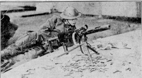
MACHINE GUNNER ON DUTY AT ROLLING MILLS

Since troops on guard at the mill for five days were removed by orders of Governor Edwin P. Morrow last Saturday afternoon, he was informed, has grown steadily worse around the mill, where workers have been on strike for months. The days by isolated fighting and the days by boisterous tactics laid to