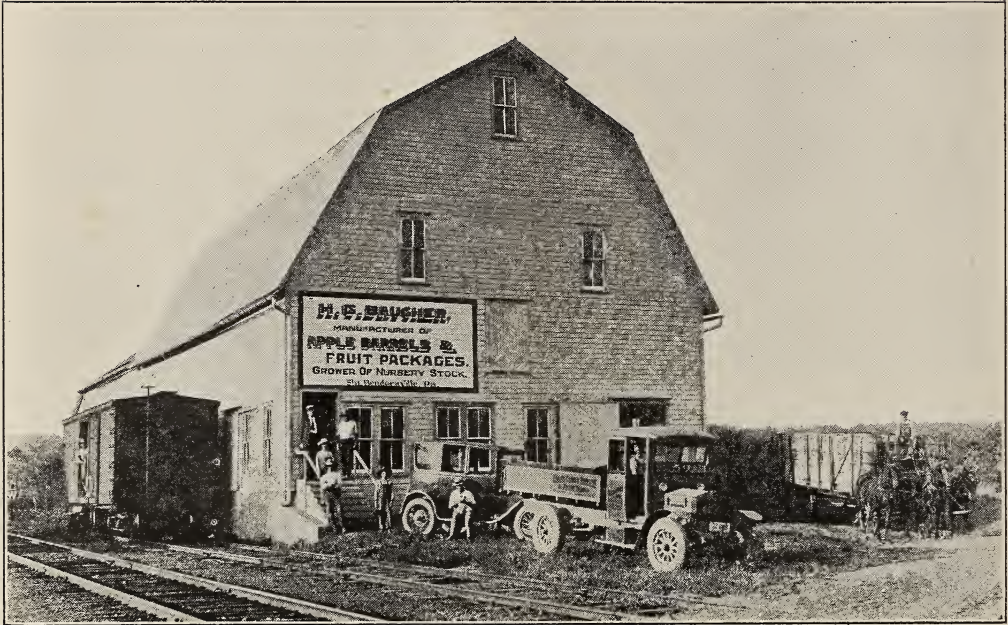
Packing House and Barrel Factory

Right by the nursery will be reserved to ship the most convenient way express or parcels post.