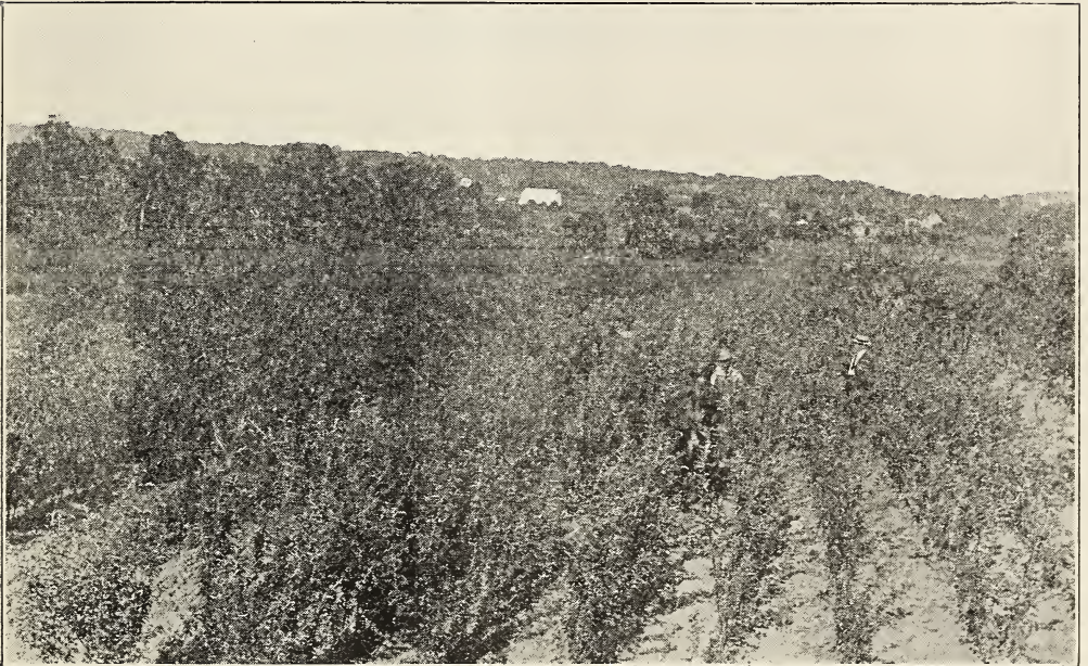
Block of Two-Year Apple Trees

Duchesse of Oldenburg. Good large size golden streaked red. sub-acid, fine shipper and market apple, last of July.