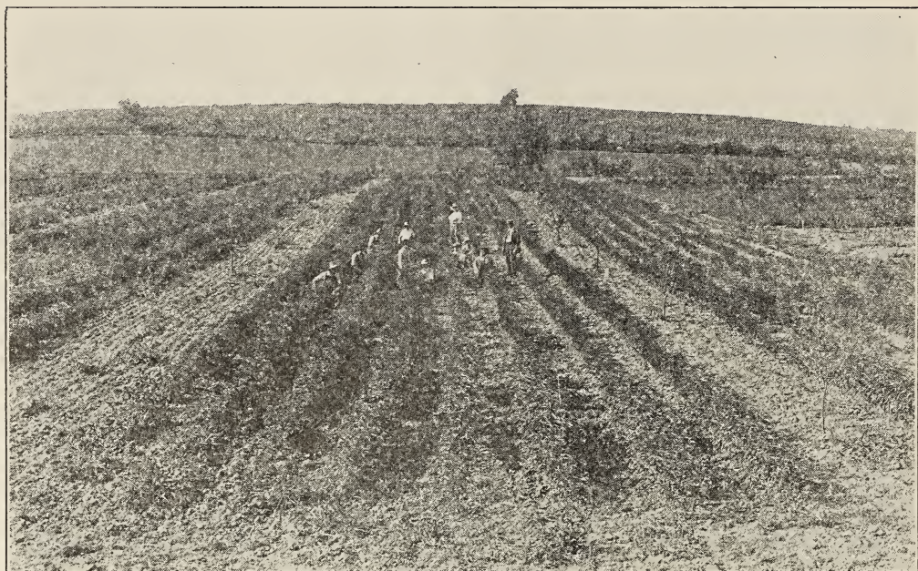
Budding Block of Young Peach Trees

Crawfords Late. Large yellow, fine canning and market peach, Sept. 1st to 15th.