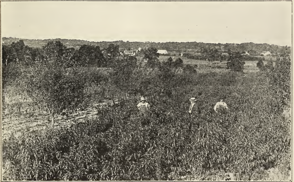
Block of One-Year Peach Trees

Champion, a large handsome, early variety, creamy white with