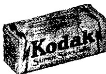
"SS" Panchromatic film.