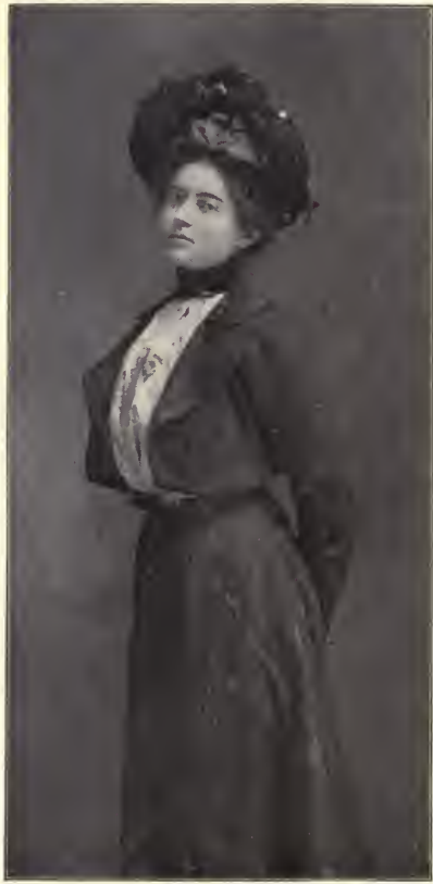
MARY MAC LANE