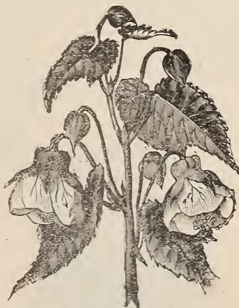
ABUTILON BOULE DE NEIGE.