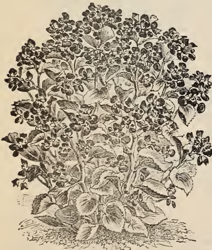
BEGONIA SEMP. GIGANTEA ROSEA.

Abutilon Erecta , flower stands up erect; color pink; strong grower, profuse bloomer: price, 2-inch pots, $1.00 per doz.