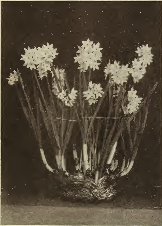
Paperwhite Narcissus in Pebbles and Water