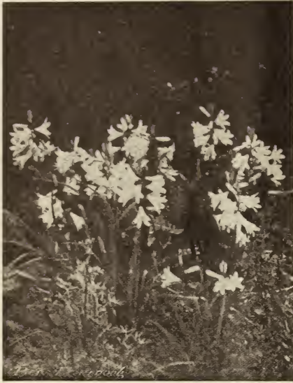
St. Bruno Lily