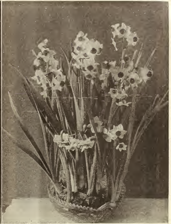
Soleil D'Or Narcissi in Pebbles and Water