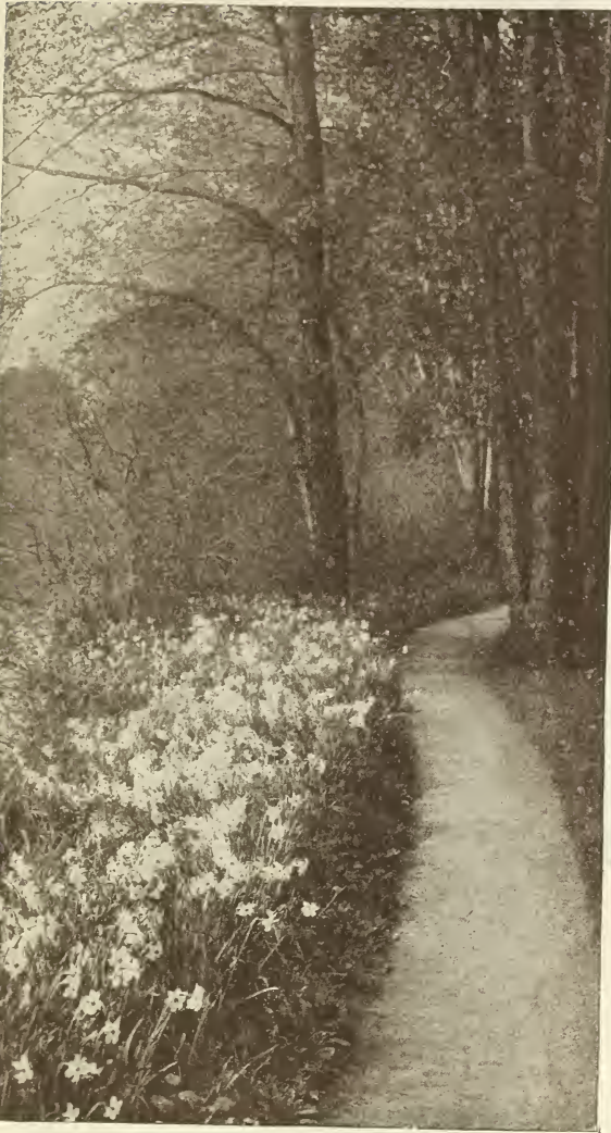
A Border of Naturalized Narcissus

Whose Silver and Gold flashes through the tender green of early Spring