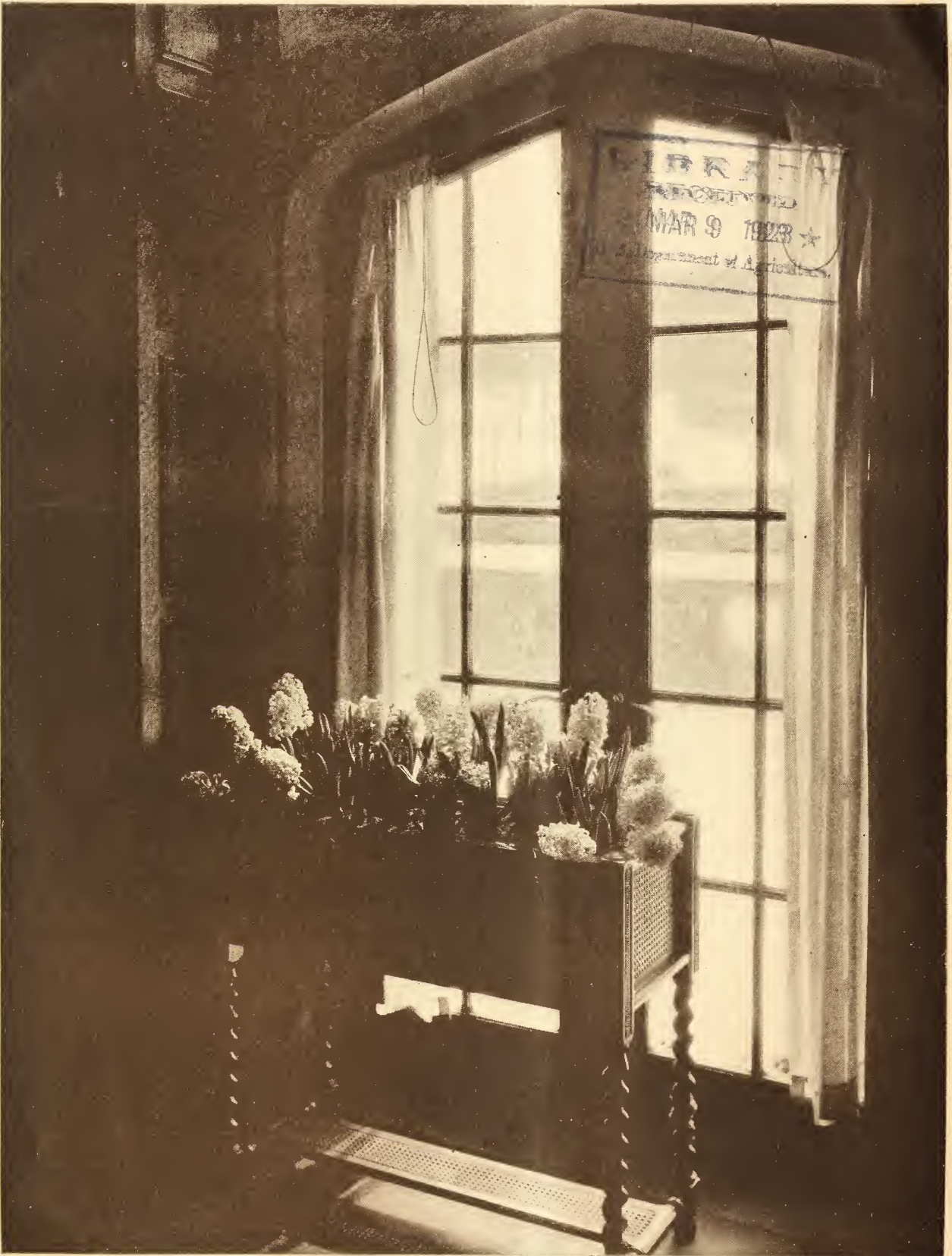
Prepared Hyacinths growing in our Moss Fiber

Th. H. Berger & Co. 70 Warren St., New York