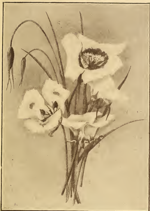
Calochortus—Mariposas, or Butterfly Tulips