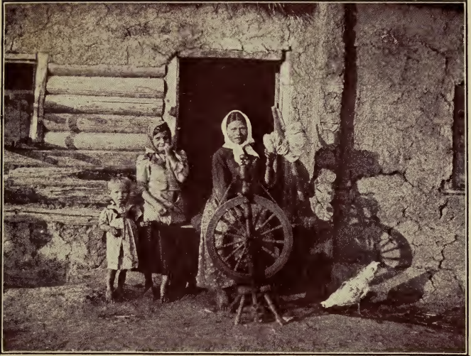
The Home of a Russian Peasant