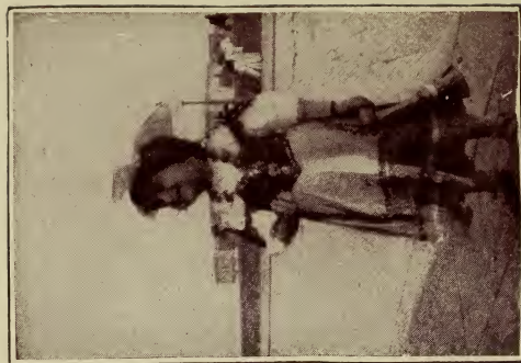
A Little Maid of Italy