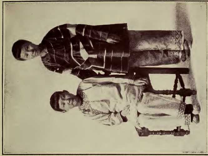
Rescued Slave-Girls (New York City)