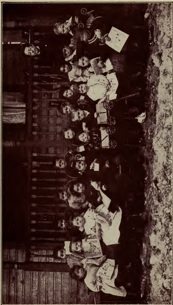
Italian Kindergarten (Penn.)