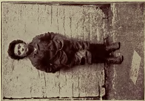
A Jewish Immigrant