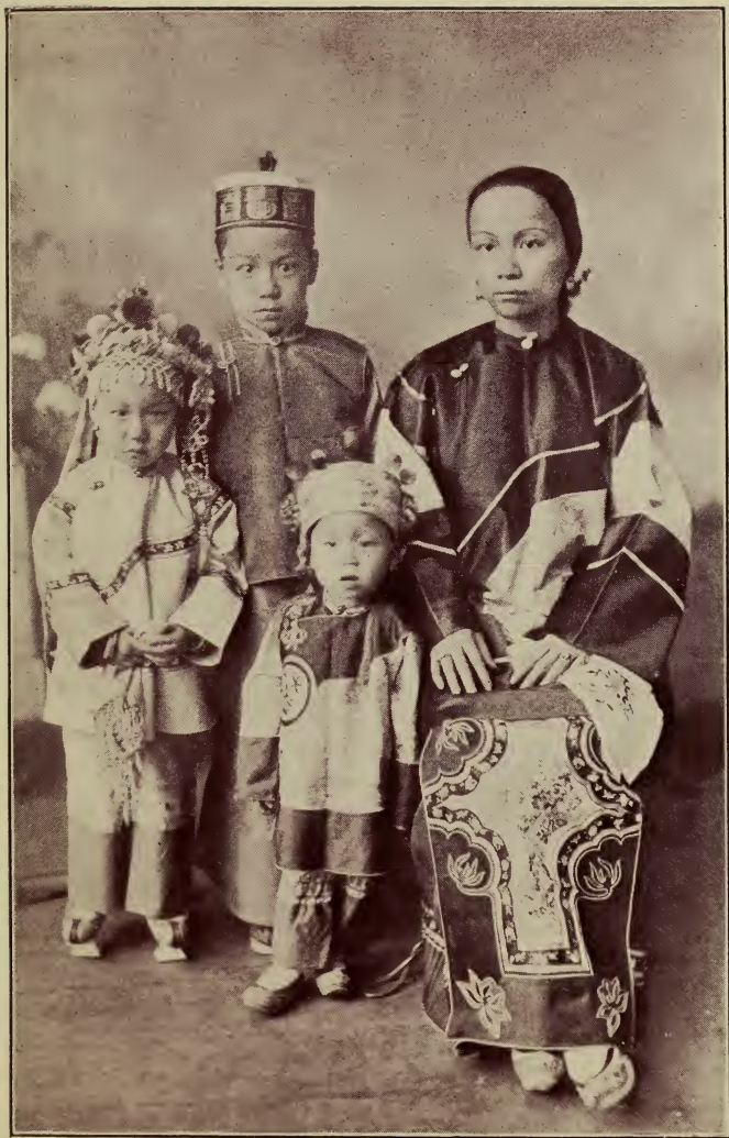
A Chinese Family (Church of All Nations, New York City)