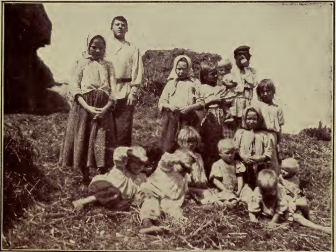
A Russian Moujik and His Family