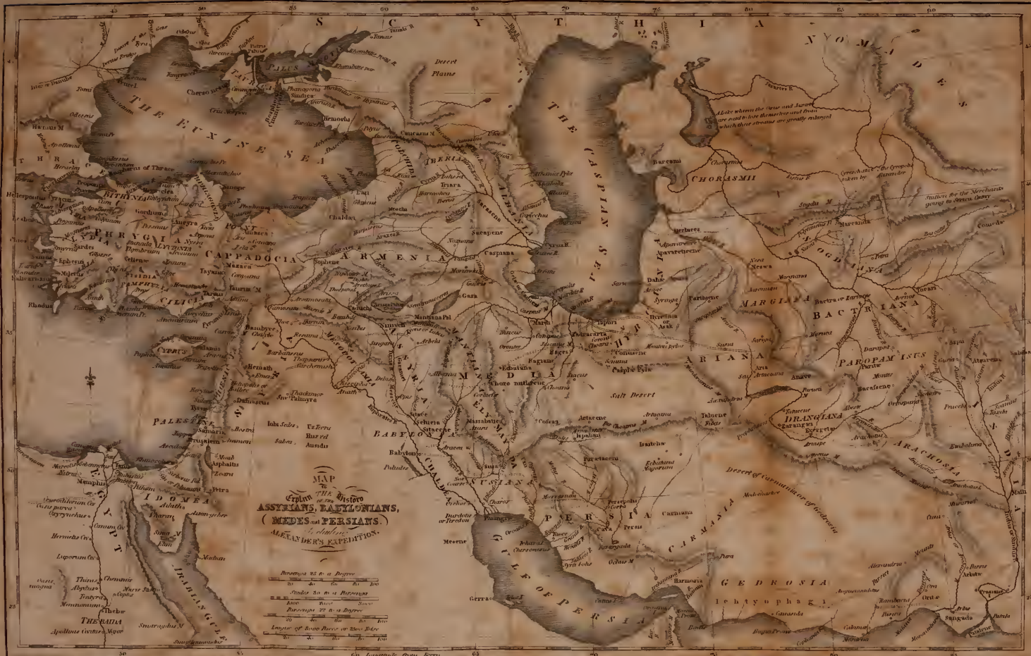
MAP OF THE DISTRICTS OF THE ASSYRIANS, BABYLONIANS, (MEDIAE and PERSIANS) IN ALEXANDER'S EXPEDITION.