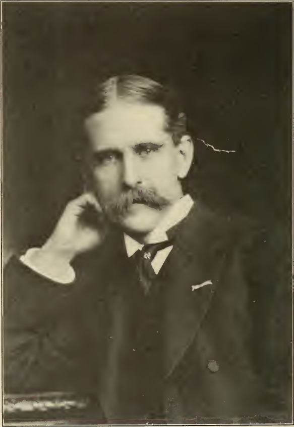
HENRY VAN DYKE, D.D., LL.D.