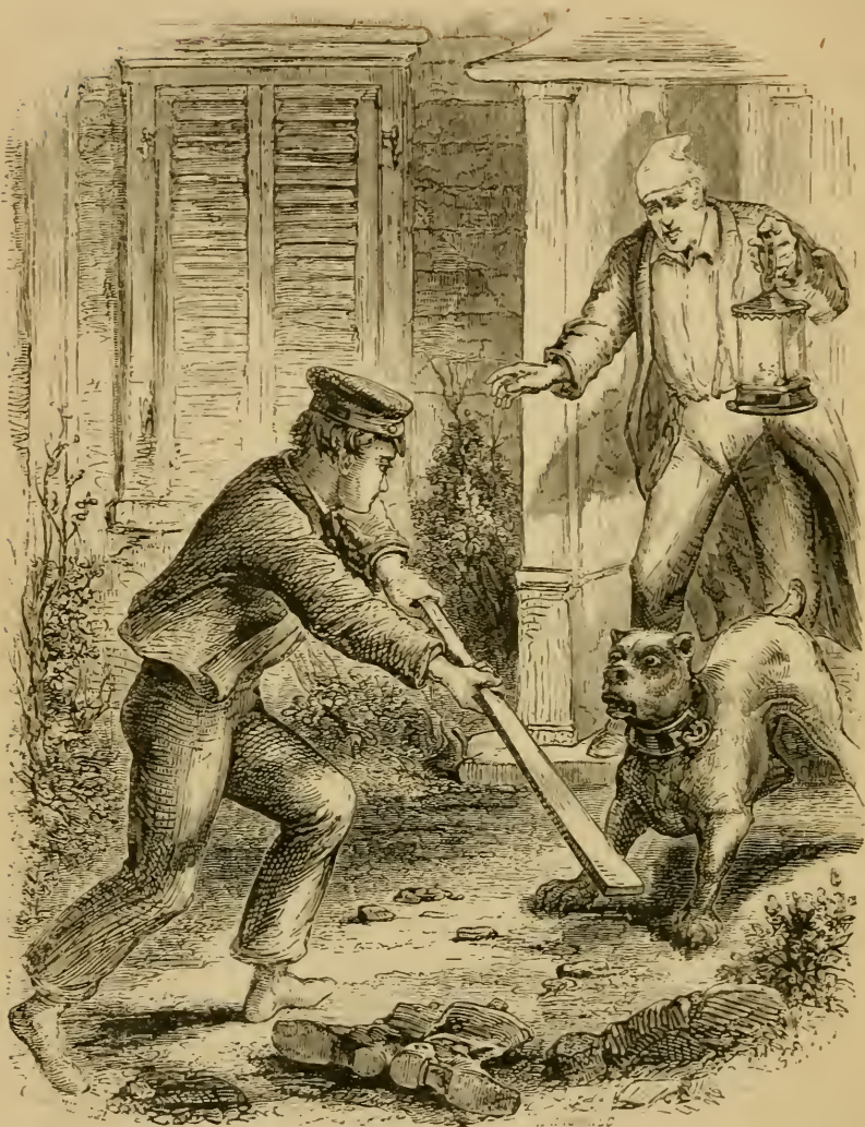
Tom's Battle at Midnight. Page 75.