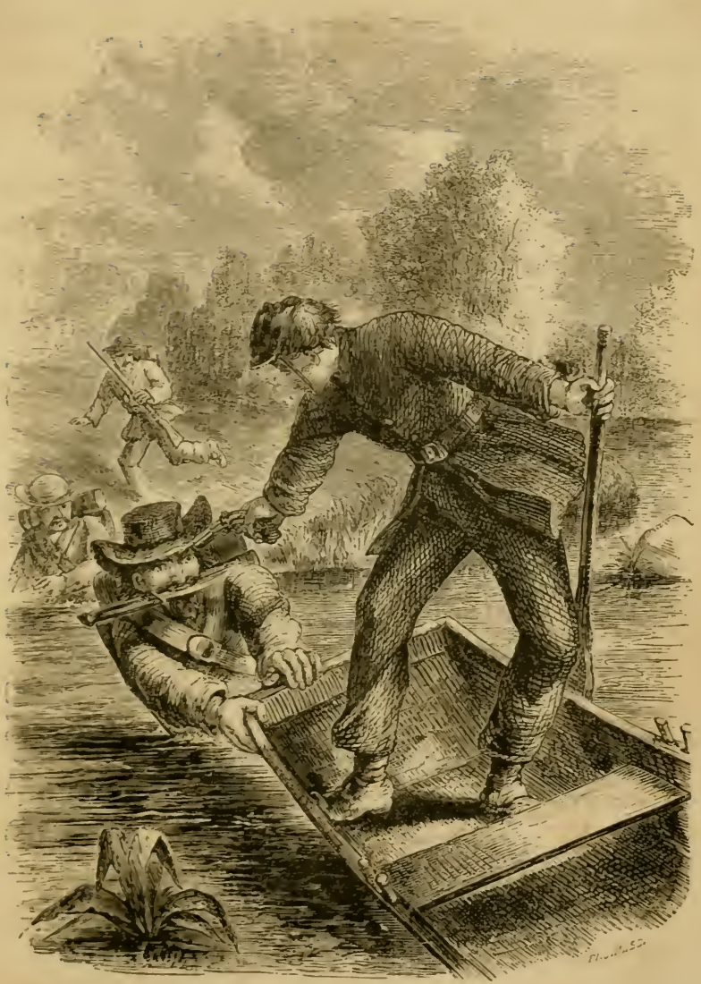
Down the Shenandoah. Page 230.