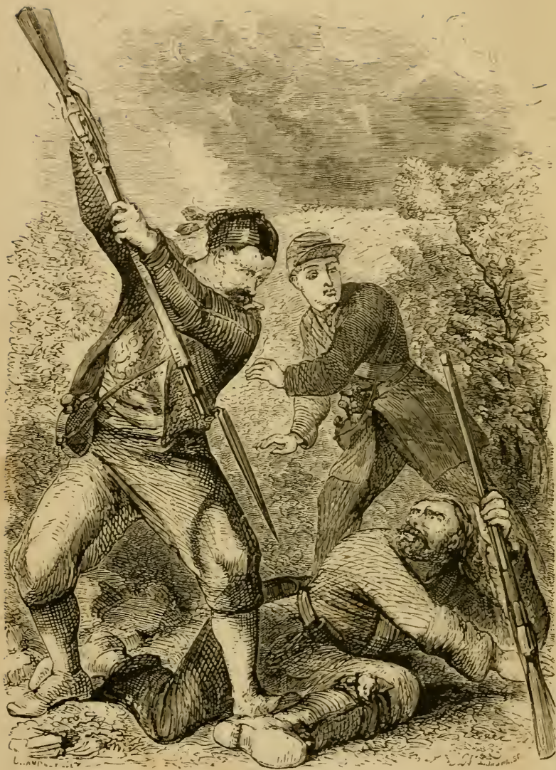
On the Retreat from Bull Run. Page 138.