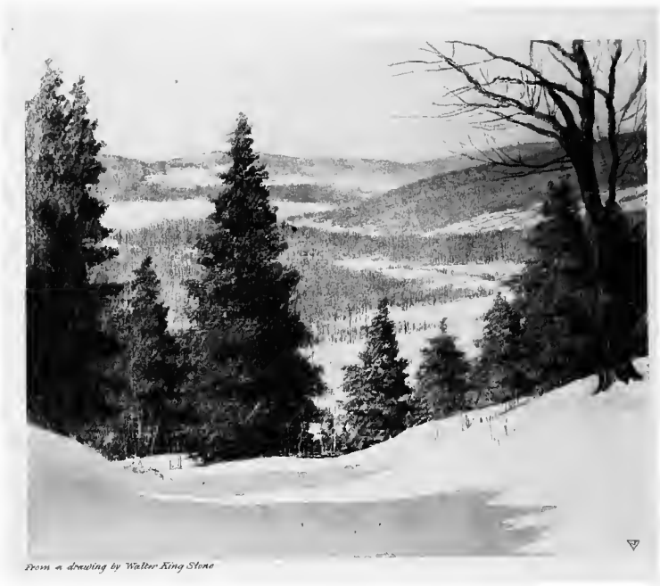
From a drawing by Walter King Stone