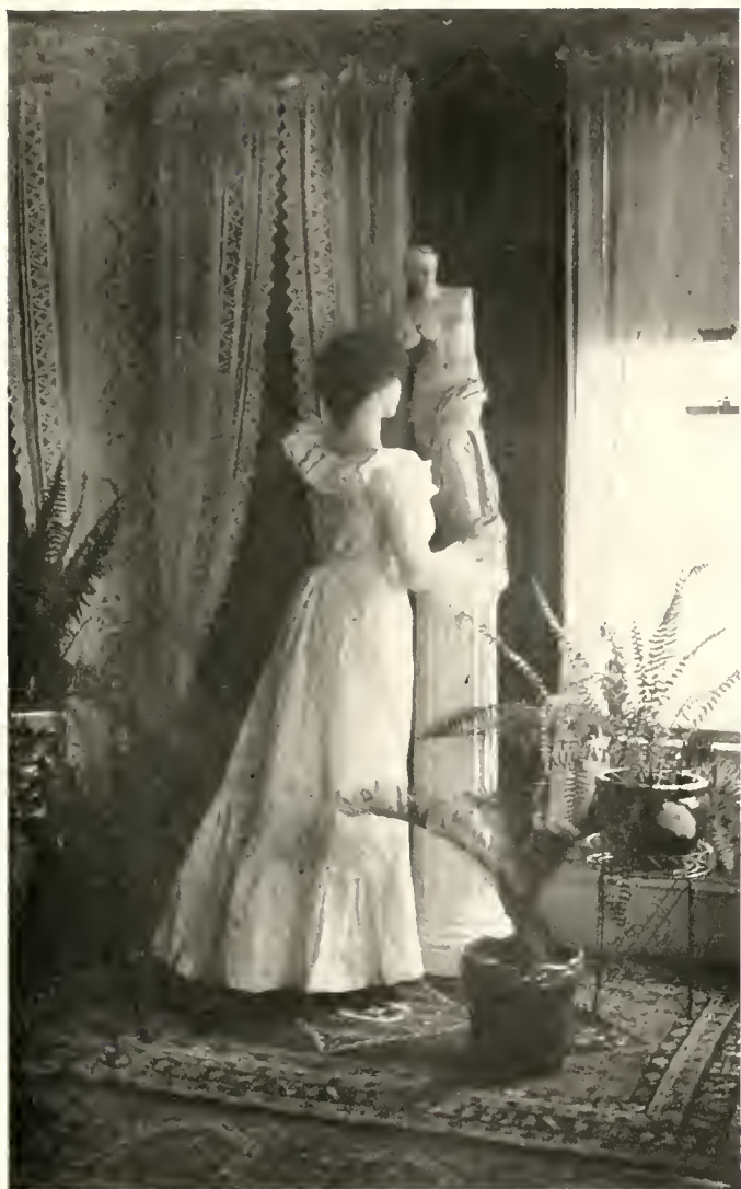
Photograph by Marshall 1902