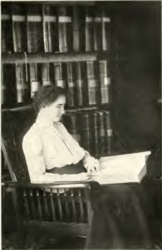
Photograph by Marshall, 1902