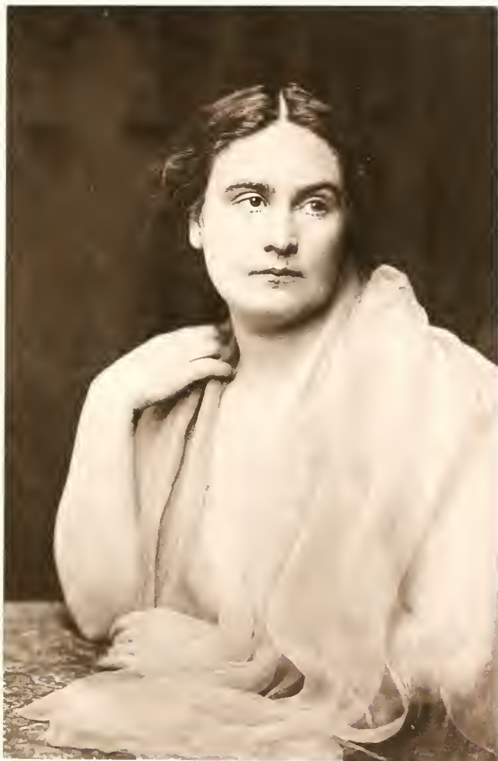
Anne Mansfield Sullivan