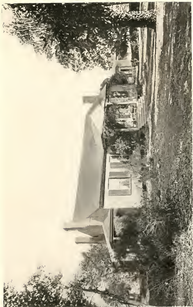
Photograph by Collins