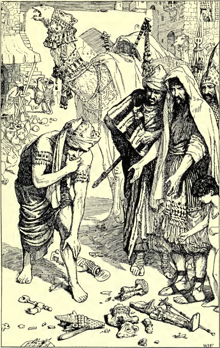
THE BIBLE ABRAHAM AND THE BROKEN IDOLS