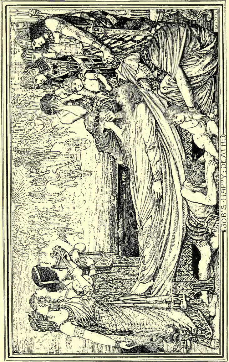
JOB'S HAPPY DEATH