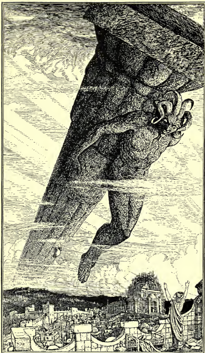
EPHIPPAS & THE DEMON OF THE RED SEA BRING THE GREAT PILLAR TO SOLOMON