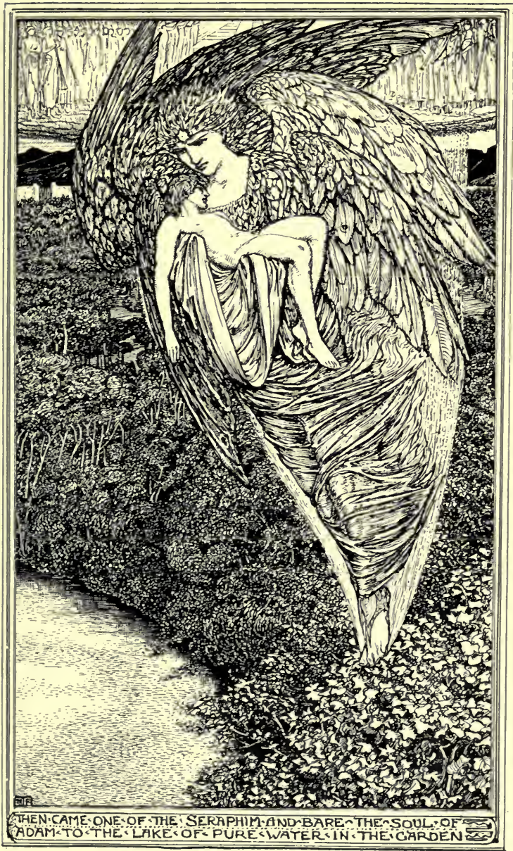
THEN CAME ONE OF THE SERAPHIM AND BARE THE SOUL OF ADAM TO THE LAKE OF PURE WATER IN THE GARDEN