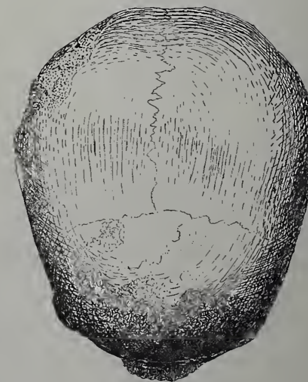
FIG. 6 (No. 164).