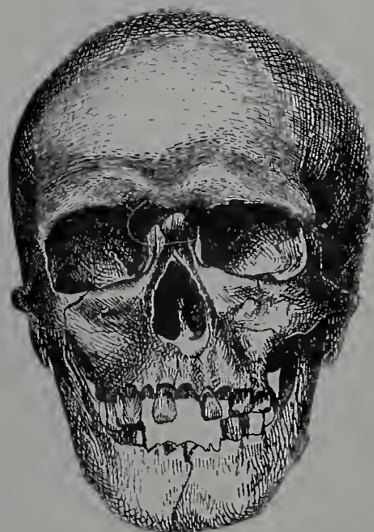
FIG. 2 (No. 346A).