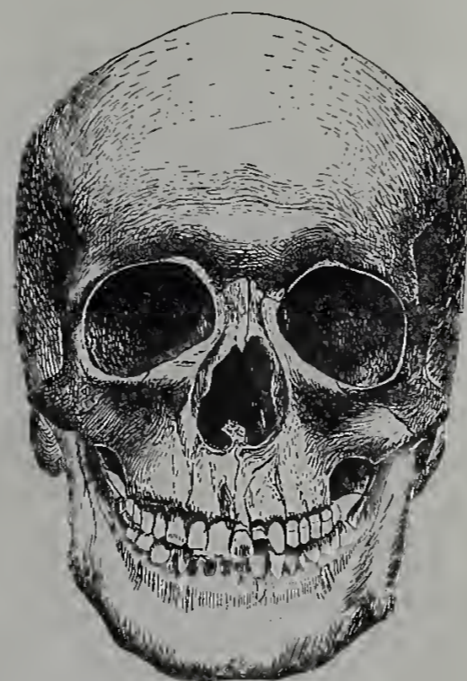
FIG. 4 (No. 346B).