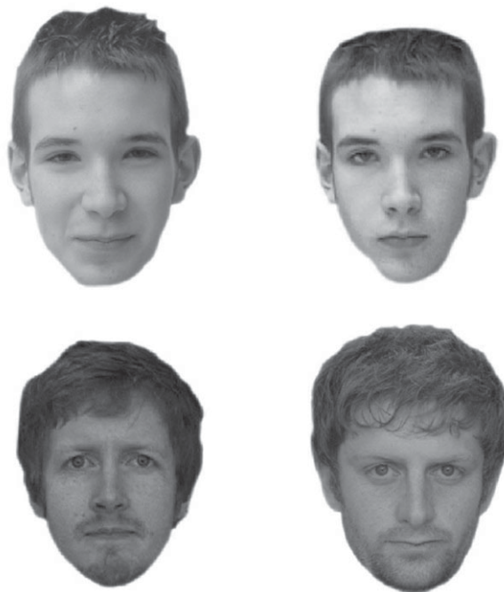
Figure 1. Example image pairs from the Glasgow Face-Matching Test, reproduced from a previous publication [13]. The top row shows a same identity pair and the bottom row shows a different identity pair.