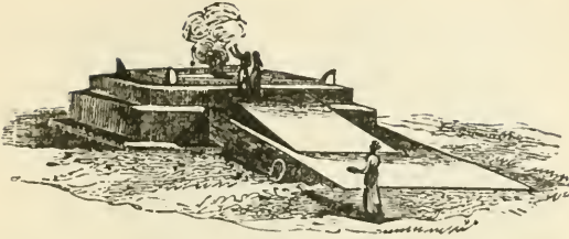
ALTAR OF SACRIFICE.

The tabernacle itself was fifty-two feet and a half long, seventeen and a half wide, and the same high. It was made with planks of shittim wood, skillfully fitted and held together by poles, which ran the whole length through golden rings. The planks were overlaid with gold. To defend it from the weather it was hung without with curtains of a kind of canvass, made of goat's hair, and over the whole was thrown an awning of skins.