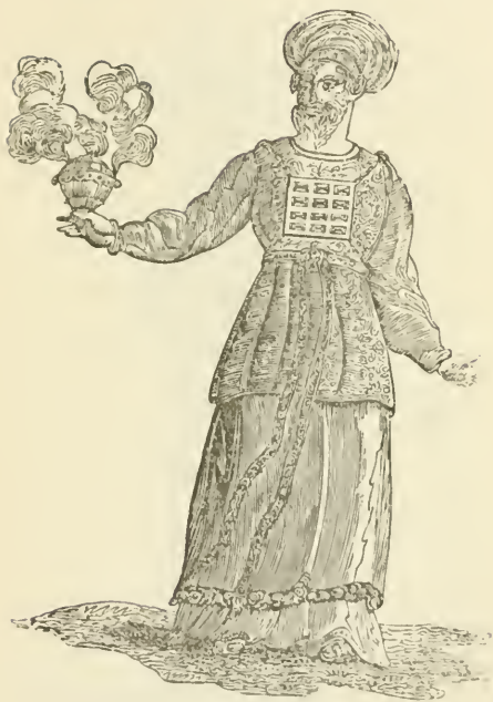
THE HIGH PRIEST