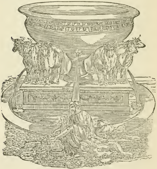
THE BRAZEN SEA.

covered with the same precious metal. All the vessels, the 10 candlesticks, 500 basins, and all the rest of the sacrificial and other utensils, were of solid gold. Yet the Hebrew writers seem to dwell with the greatest astonishment and admiration on the works which were founded in brass by Hiram a man of Jewish extraction, who had learned his art at Tyre. Besides the lofty pillars above mentioned there was a great tank, called a sea, of molten brass supported on twelve oxen, three turned each way; this was 17\frac{1}{2} feet in diameter.