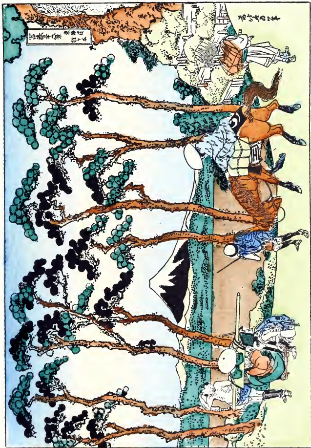
One of the „Thirty-six Views of Fuji“