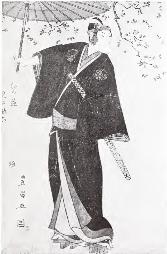
ACTOR IN THE PLAY "SUKEROKU"