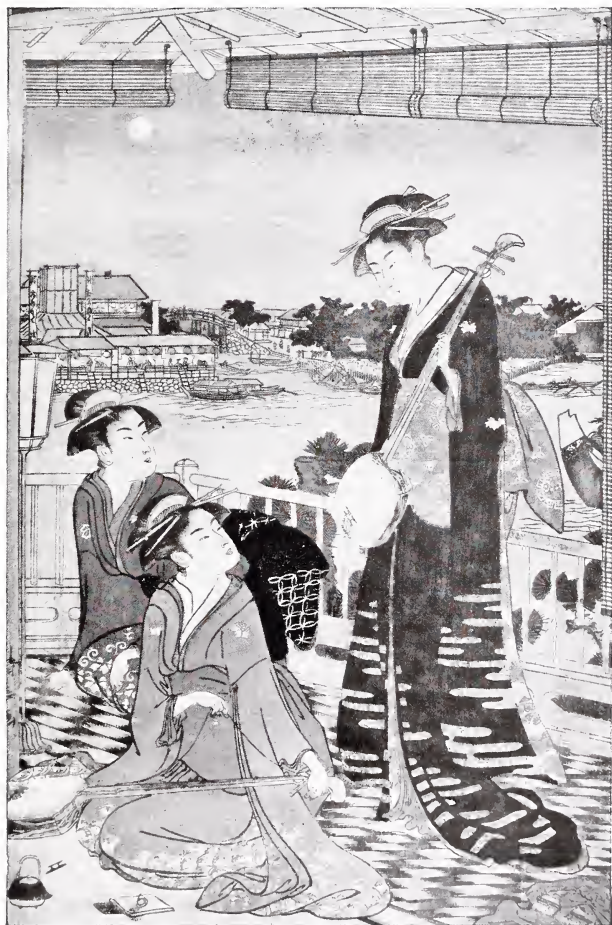
SUMMER EVENING ON THE SUMIDA RIVER