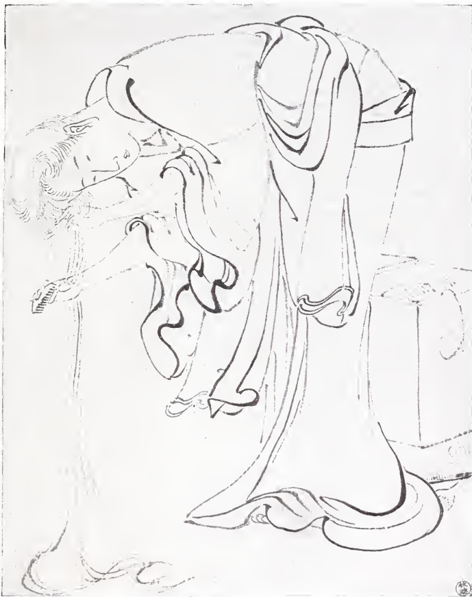
GIRL AT HER TOILET