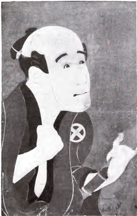
PORTRAIT OF AN ACTOR