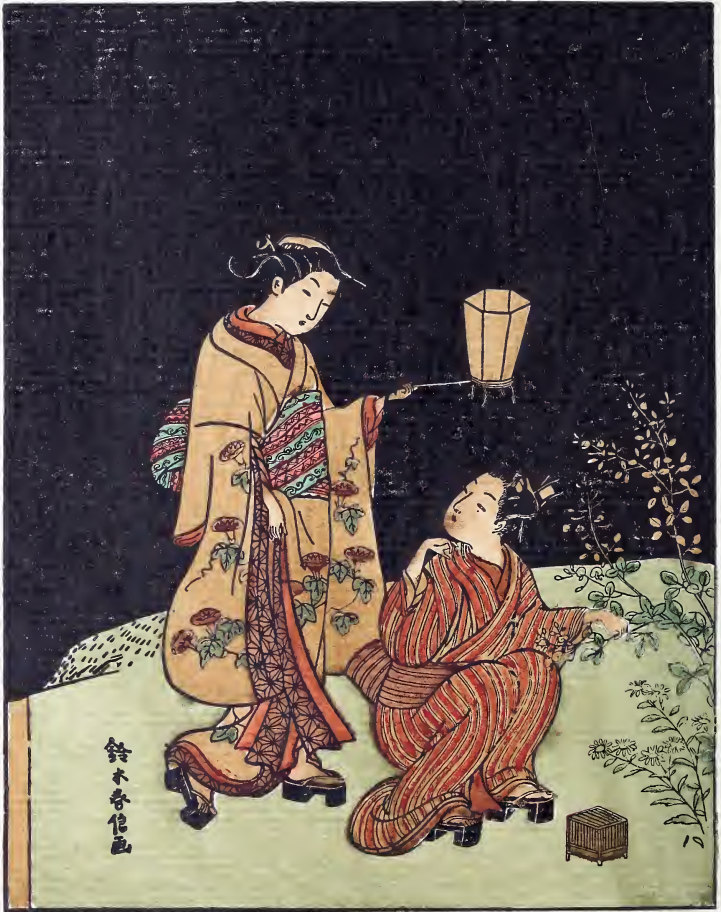
Capturing the Grasshopper