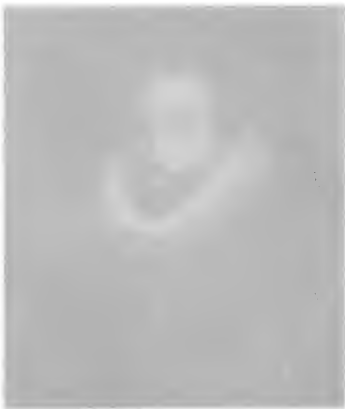
Sir Francis Walsingham.