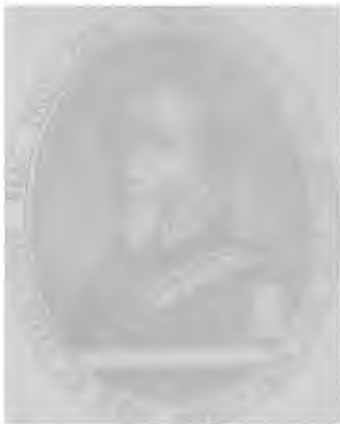
Maurice of Nassau.