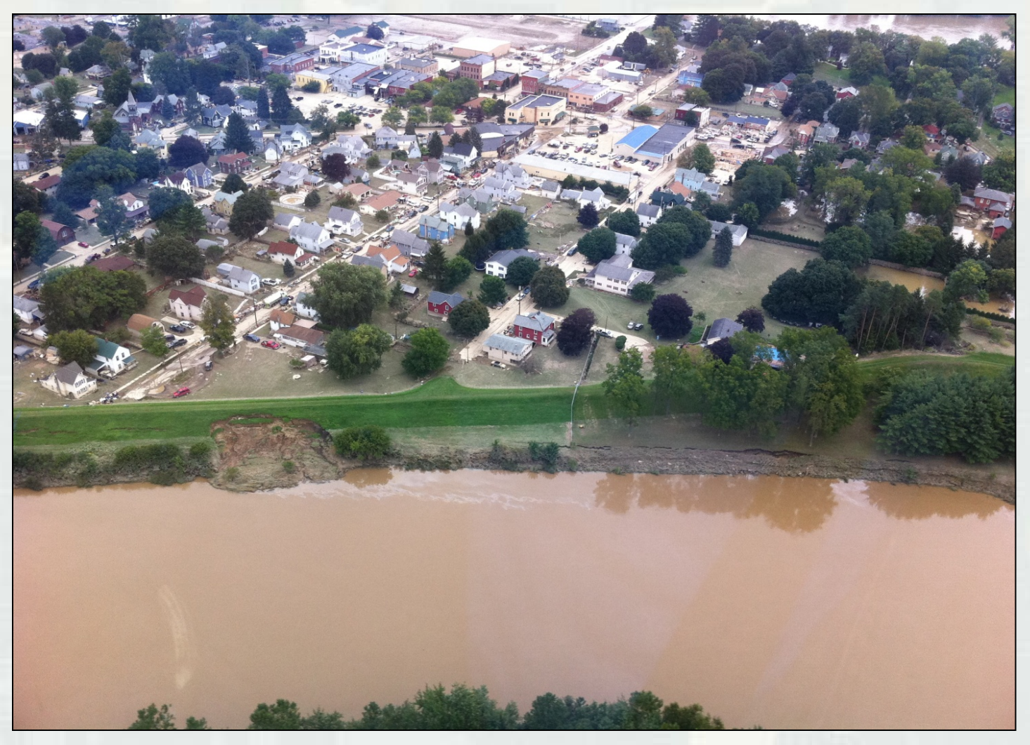
Athens – Chemung River, PA – Damage to Levee