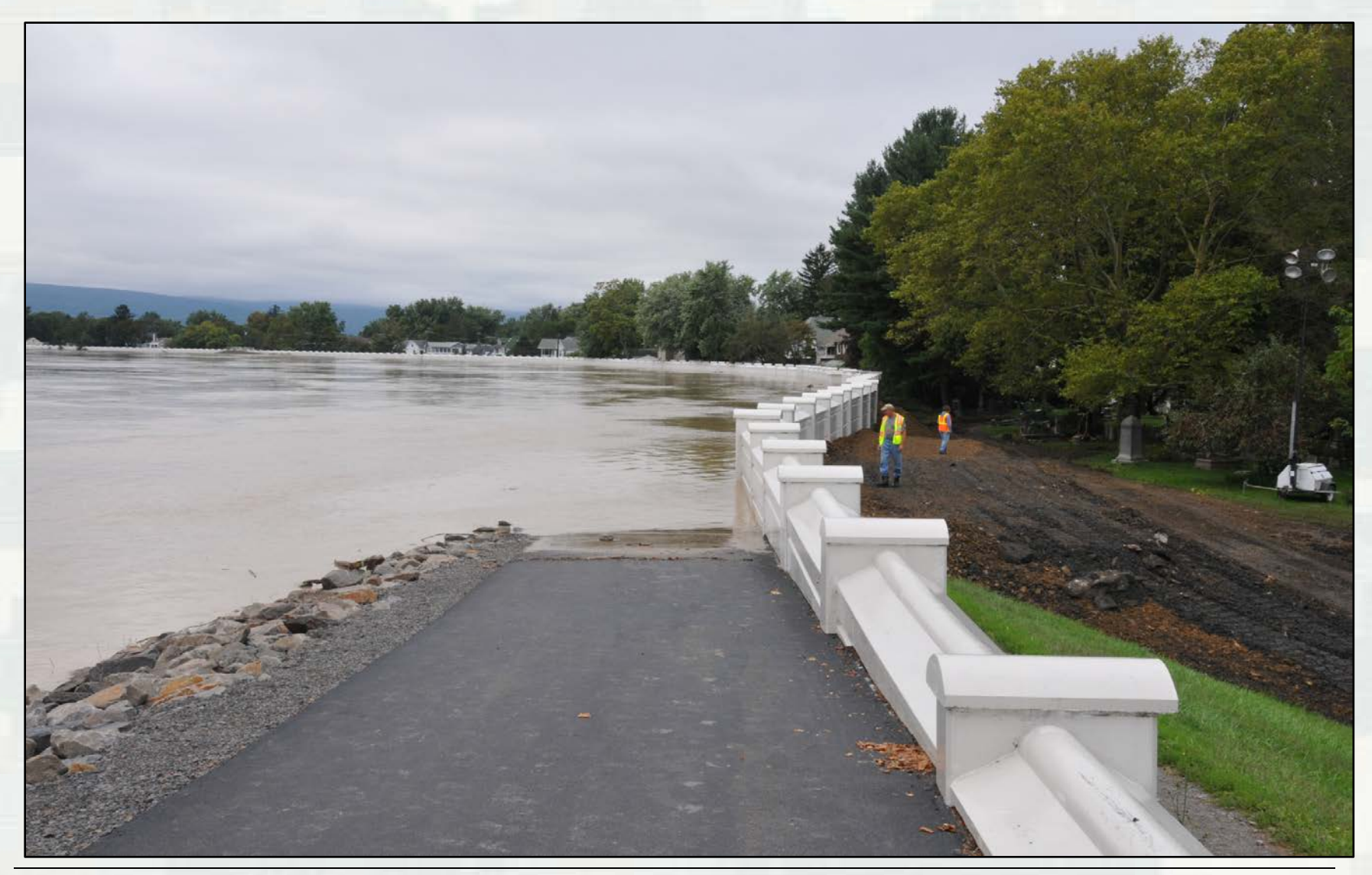
Wyoming Valley, PA – Reinforcement on Landside of Wall