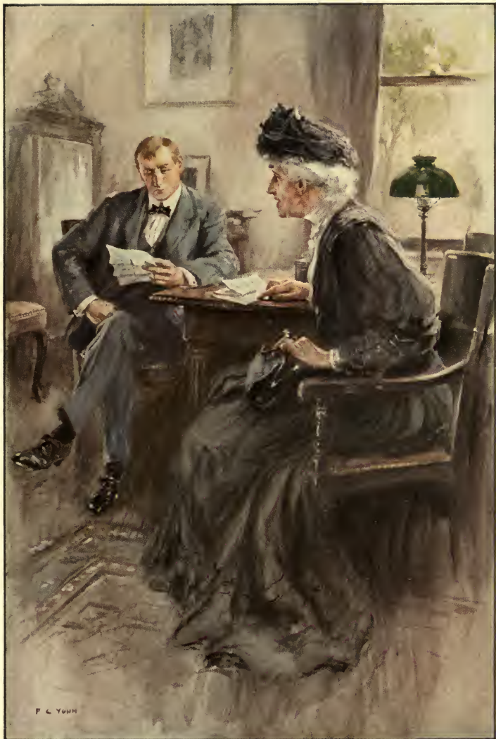
WHOEVER WROTE THAT LETTER WAS TROUBLED ABOUT SYLVIA