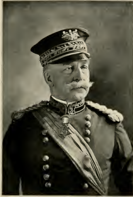
GEN. NELSON A. MILES (To face p. 438)