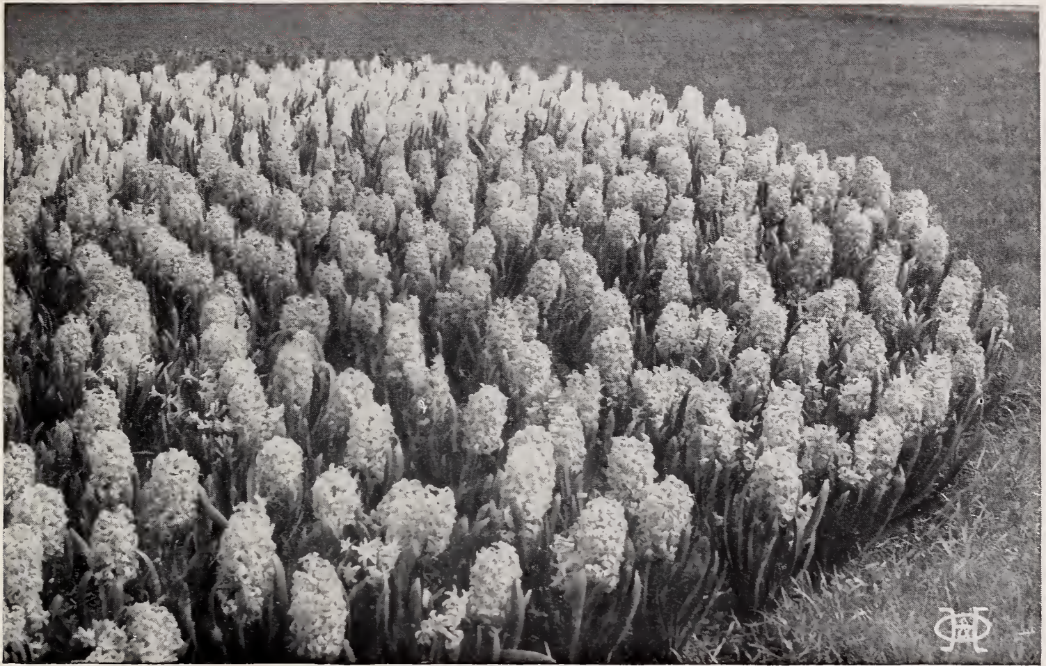
The Hyacinths come soon after the Daffodils and just before the Tulips