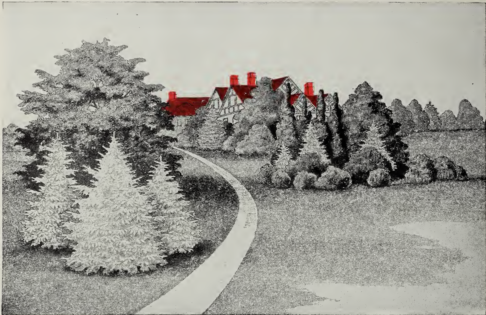
Illustration from our booklet, "Landscape Development"

T O know how to group and mass the growing things so as to develop every attractive feature of the grounds, to have every part of the planting in perfect accord with every other part, is the science of Landscape Gardening. These come only as the result of study.