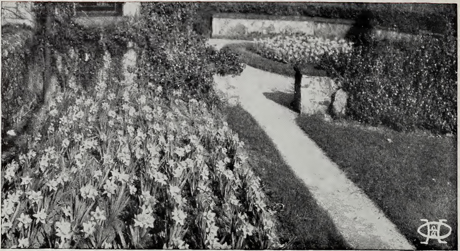
The golden cups of the Daffodils make the borders lovely from early April till late in May