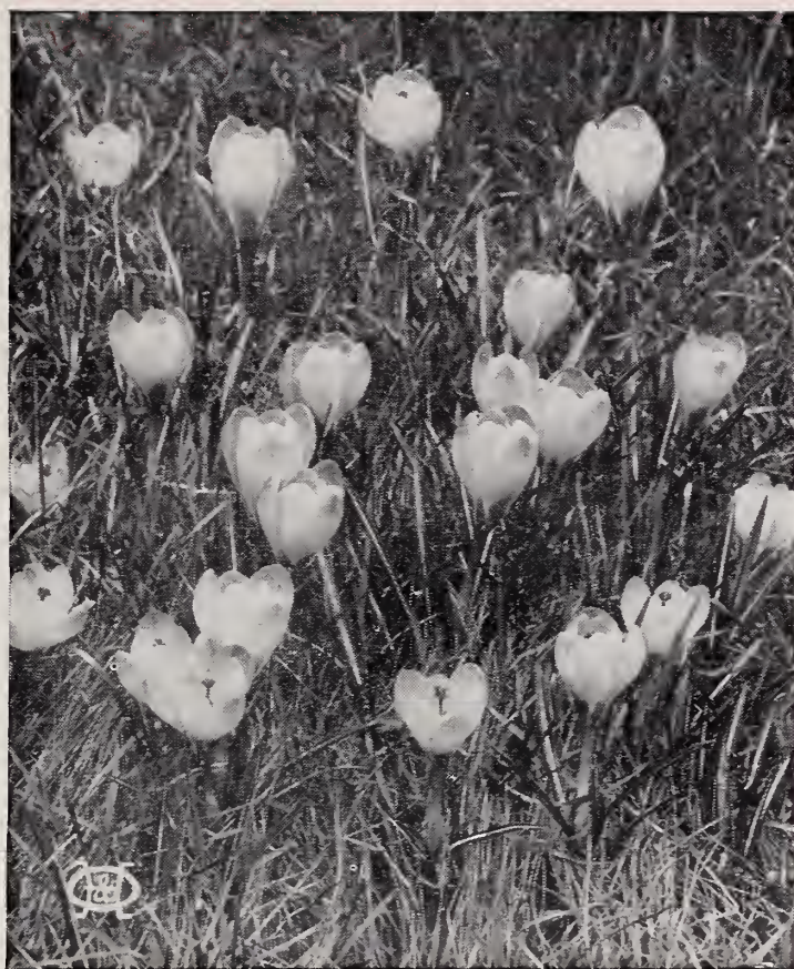
Crocus naturalized in the garden border