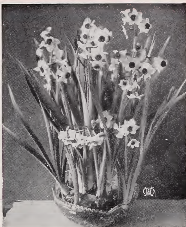
Chinese Sacred Lily (see page 6)