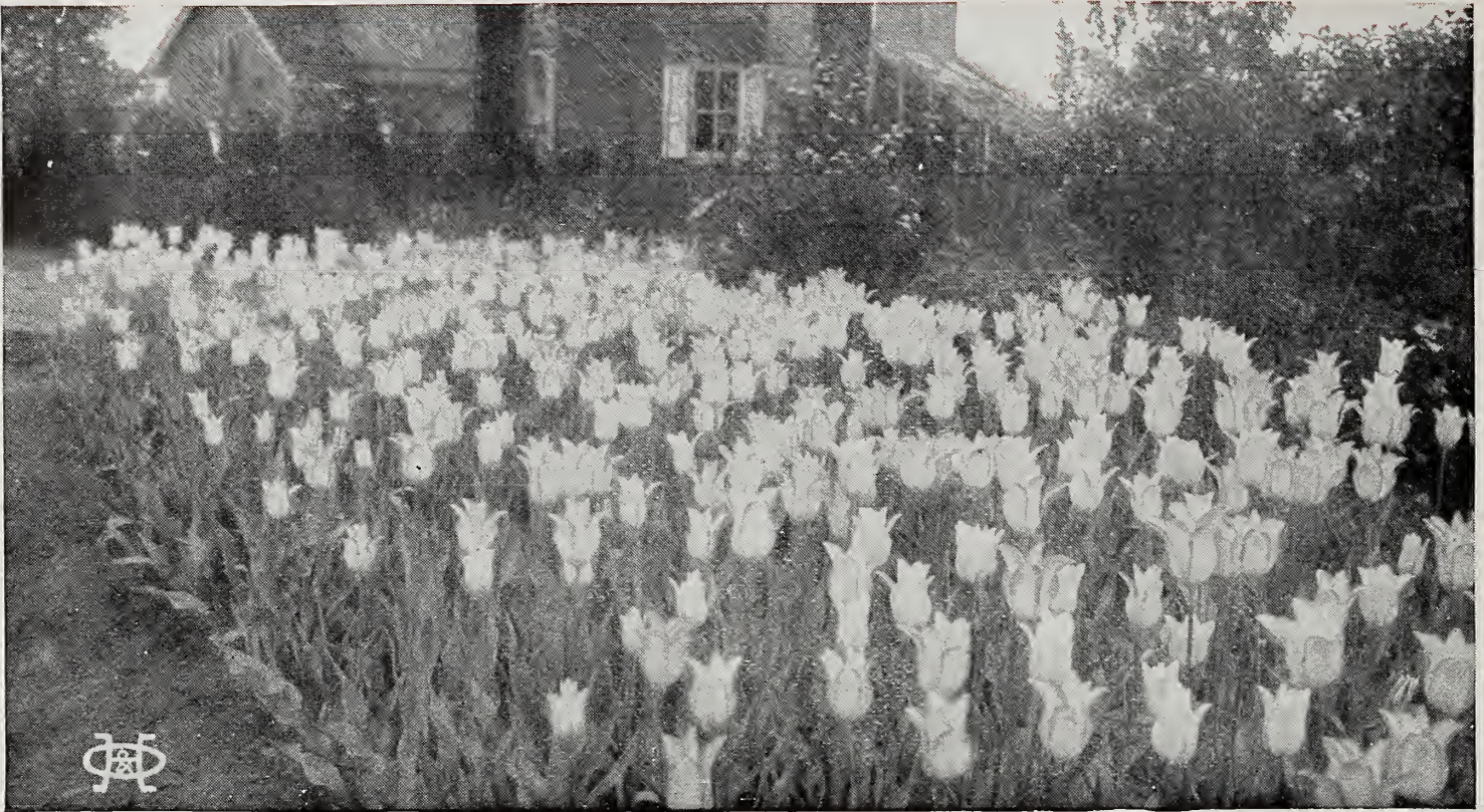
The Tulip, a courtly queen, with a chalice of silver and gold