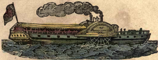
A STEAM BOAT.

This Boat sails very fast, but it is not by wind that it is forced through the water, but by steam. Steam is produced from water which is kept hot by a large fire. A steam boat will sail against the wind. They are used to convey passengers over rivers, and sometimes across the wide ocean.