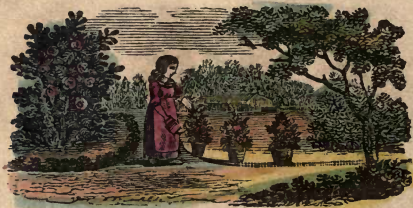
THE FLOWER GARDEN.

We will walk in the garden, Charles, and see the pretty flowers. Will you help Ann water them? Do you see that little bird, Charles? hark! how sweetly it sings, hopping from tree to tree. Away it flies; it has a nest in the tree, where the young birds lie on the fine soft moss.