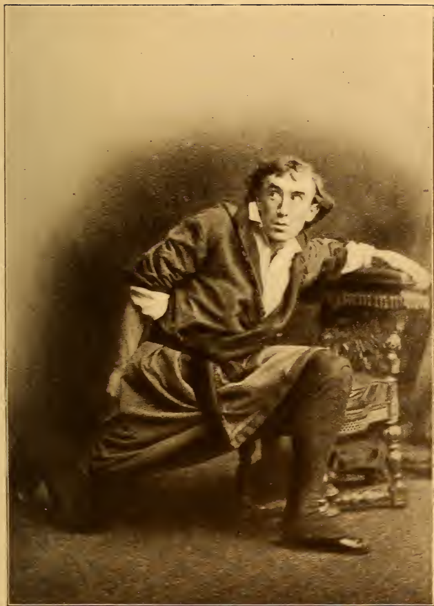
HENRY IRVING As Mathias in "The Bells."