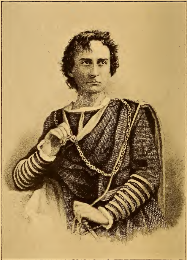
EDWIN BOOTH As Hamlet.