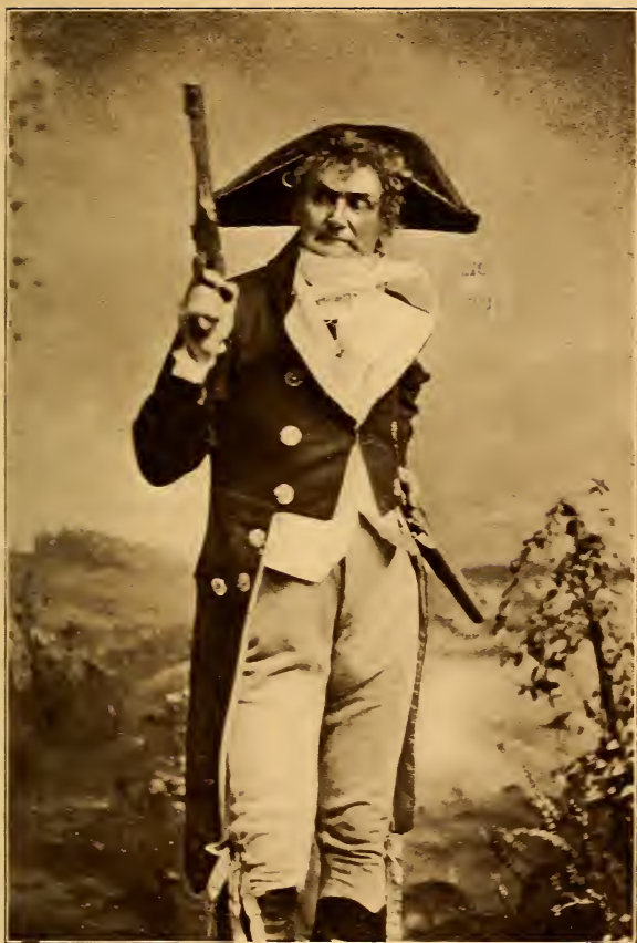
JOSEPH JEFFERSON As Bob Acres in "The Rivals."