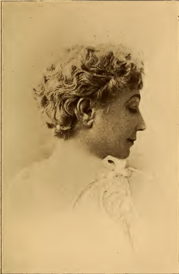
MRS. W. J. FLORENCE.