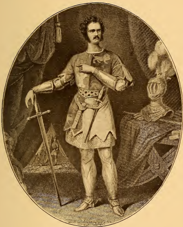
LESTER WALLACK As the Prince of Wales in "Henry IV."