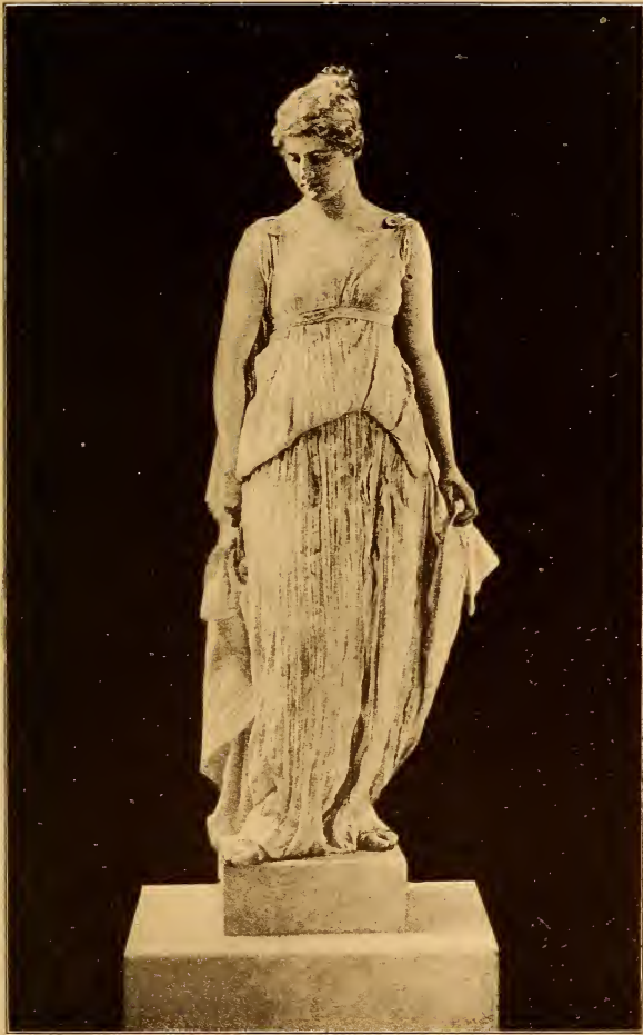
MARY ANDERSON As Galatea in "Pygmalion and Galatea."