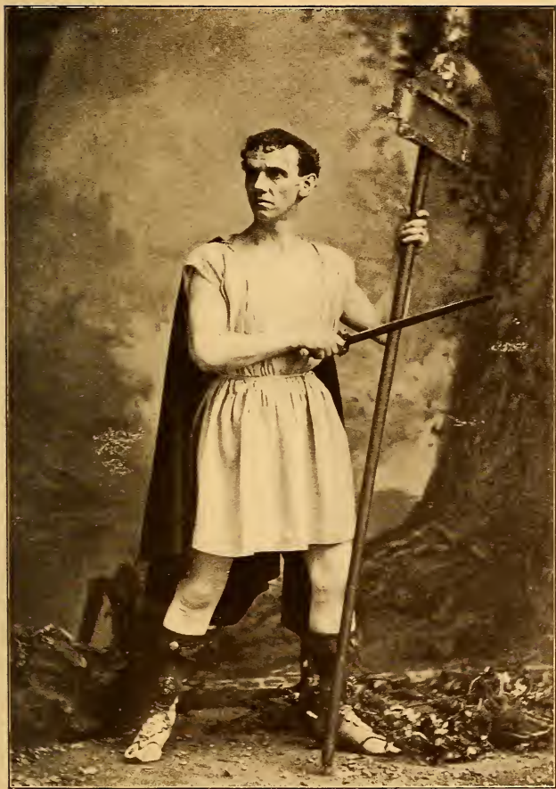
LAWRENCE BARRETT As Cassius in "Julius Cæsar."