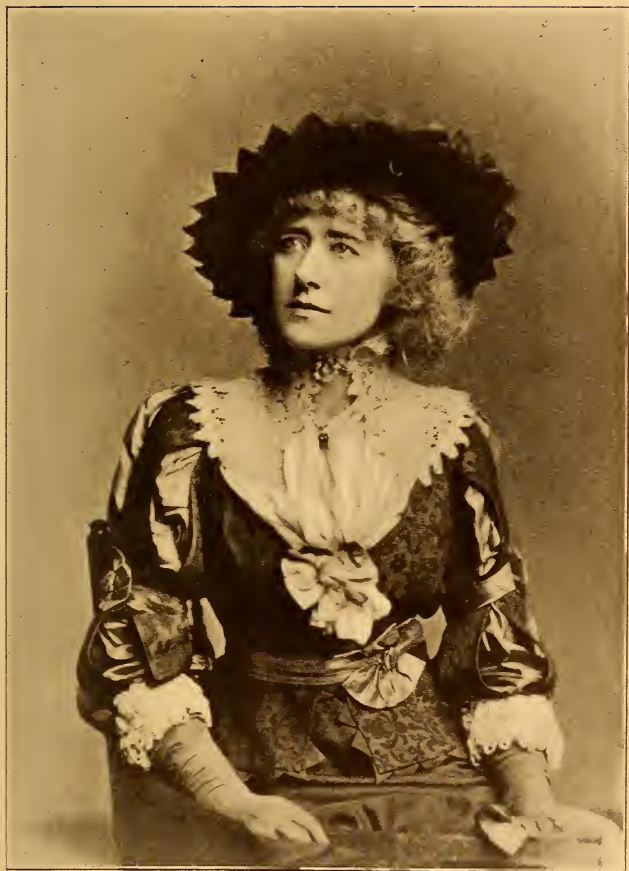
MISS ELLEN TERRY As Henrietta Maria in "Charles I."