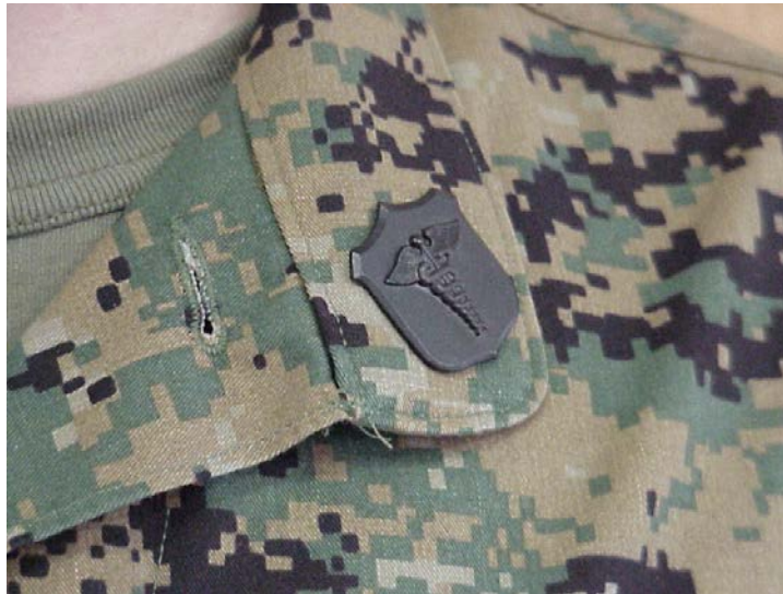
Figure 1. HM Rating Insignia

(a) The rating insignia is worn on the left collar, bisecting the angle of the point of the collar, and equally spaced \frac{1}{2} inch from either side of the collar (see figure 1).