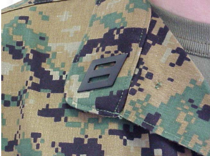
Figure 2. E-2 and E-3