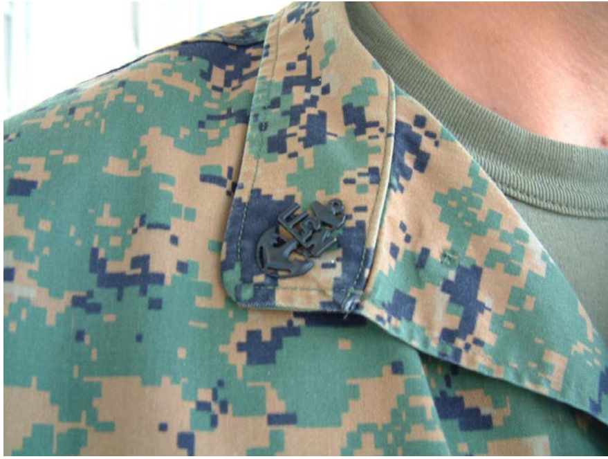
Figure 4. E-7 through E-9

(c) Breast insignia - will be centered on the pocket on a horizontal (parallel to the ground) line, even with the highest point of the service tape, a second device will be worn 1/8 inch above the 1 st device. (see figures 5)