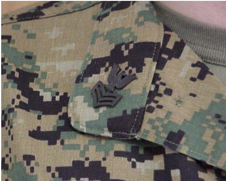
Figure 3. E-4 through E-6