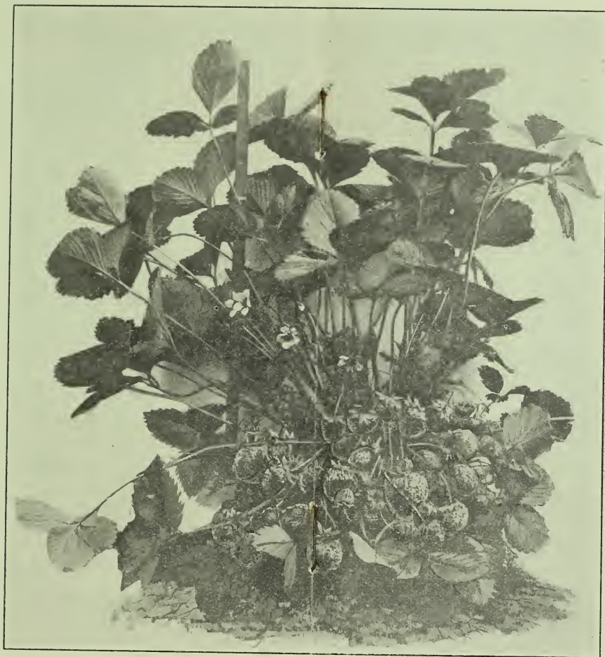
Showing Growth and Productivity of an Ettersburg Variety