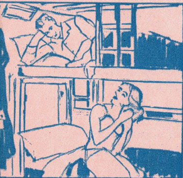
Same space is a private bedroom at night, double (as shown above) or single, for peaceful sleep.