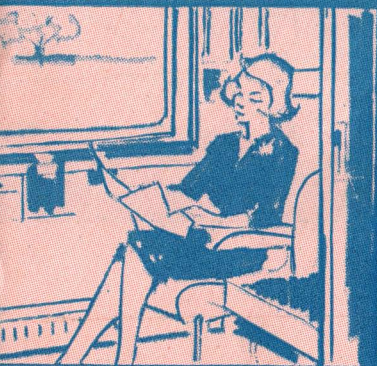
A smooth comfortable ride in a private room enables you to work, read, or relax and watch the countryside whiz by.